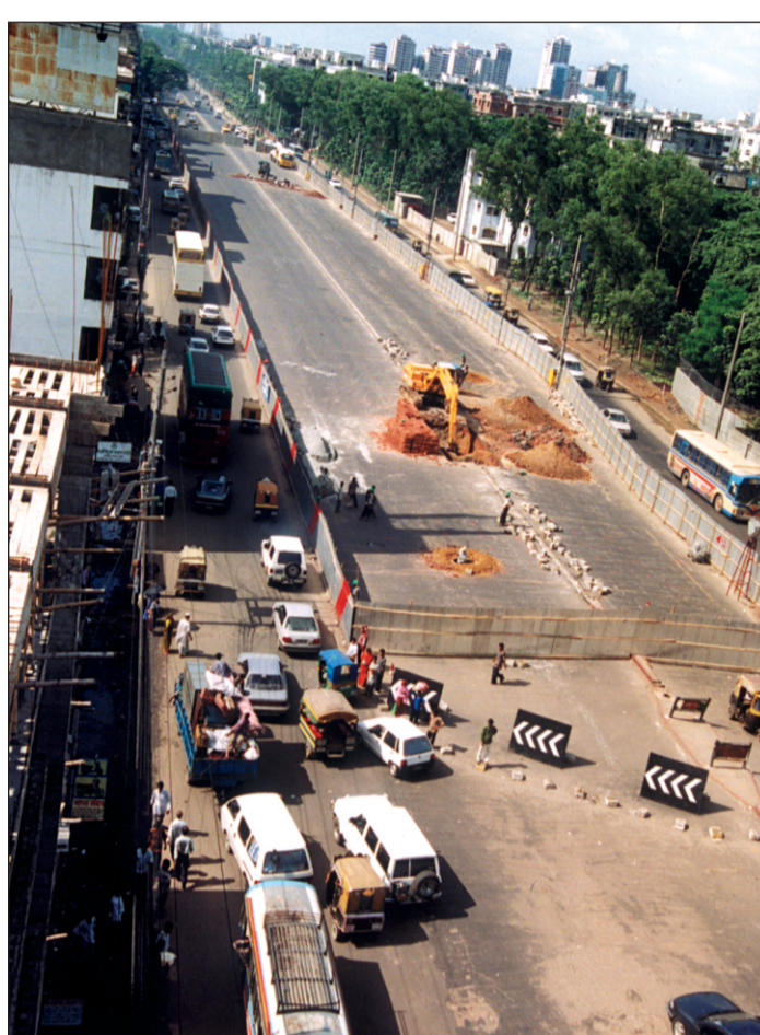
Part of the Mohakhali intersection in the city has been fenced off to facilitate construction of the flyover.