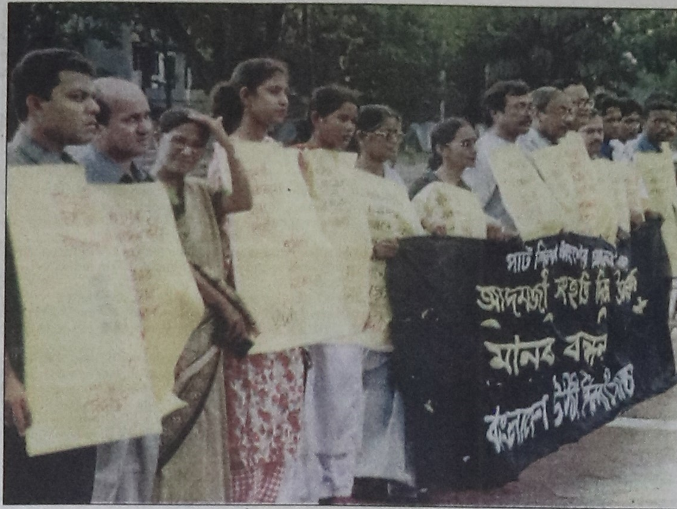
The Udichi Shilpi Goshthi formed a human chain at the Central Shaheed Minar in the city yesterday protesting the closure of Adamjee Jute Mills.

Later, the youths were taken to Itabashi ecopolis centre, an institute that is dealing with the environment issues, especially the air pollution.