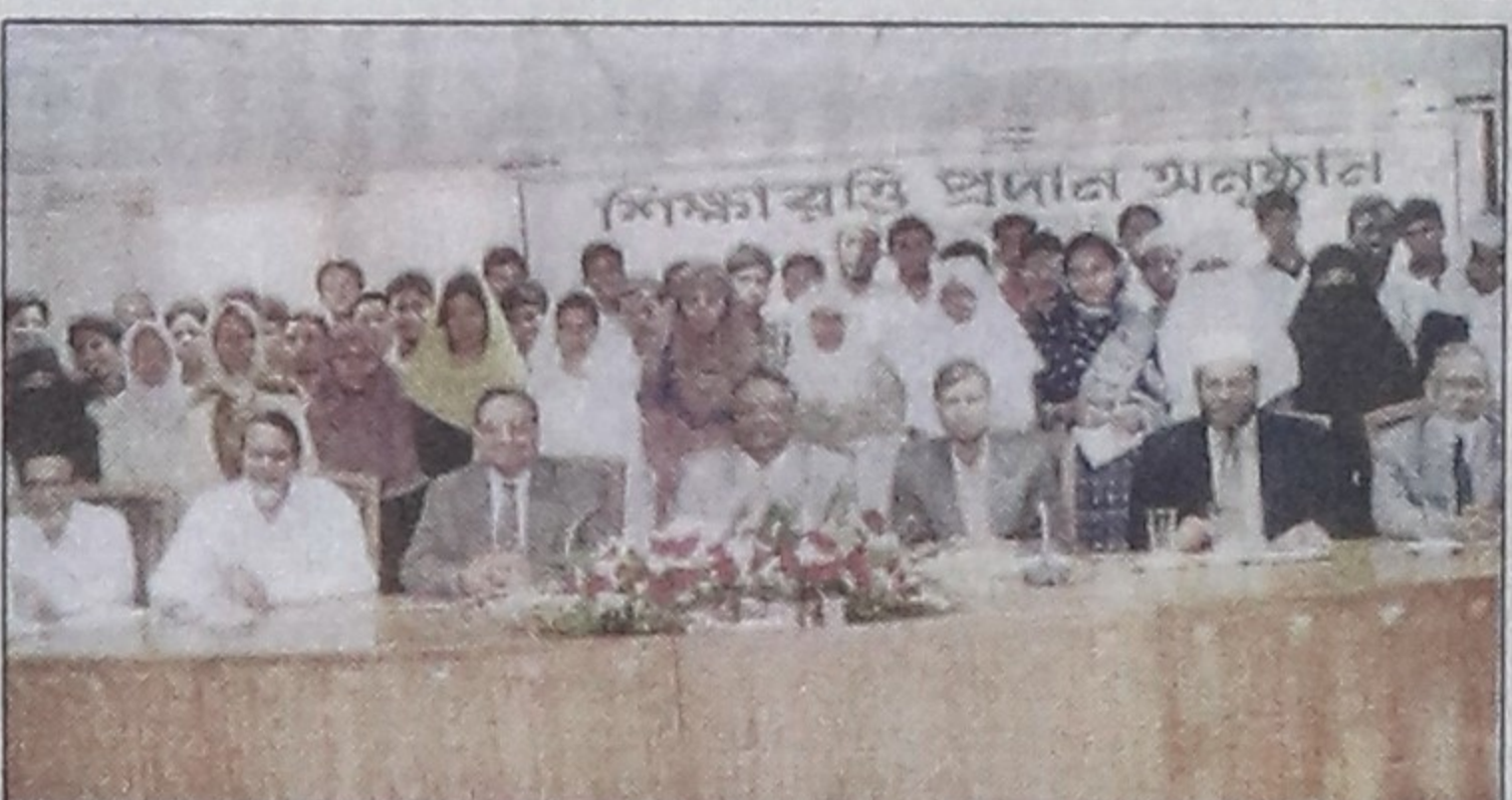
The scholarship and stipend award ceremony organised by the Islami Bank Foundation, a subsidiary organisation of Islami Bank Bangladesh Limited, was held at the conference room of the bank in the city on Monday. The recipients are seen with Education Minister Dr. Osman Faruk and other guests at the ceremony.

In this connection, a function was held at Comilla Teachers' Training College.