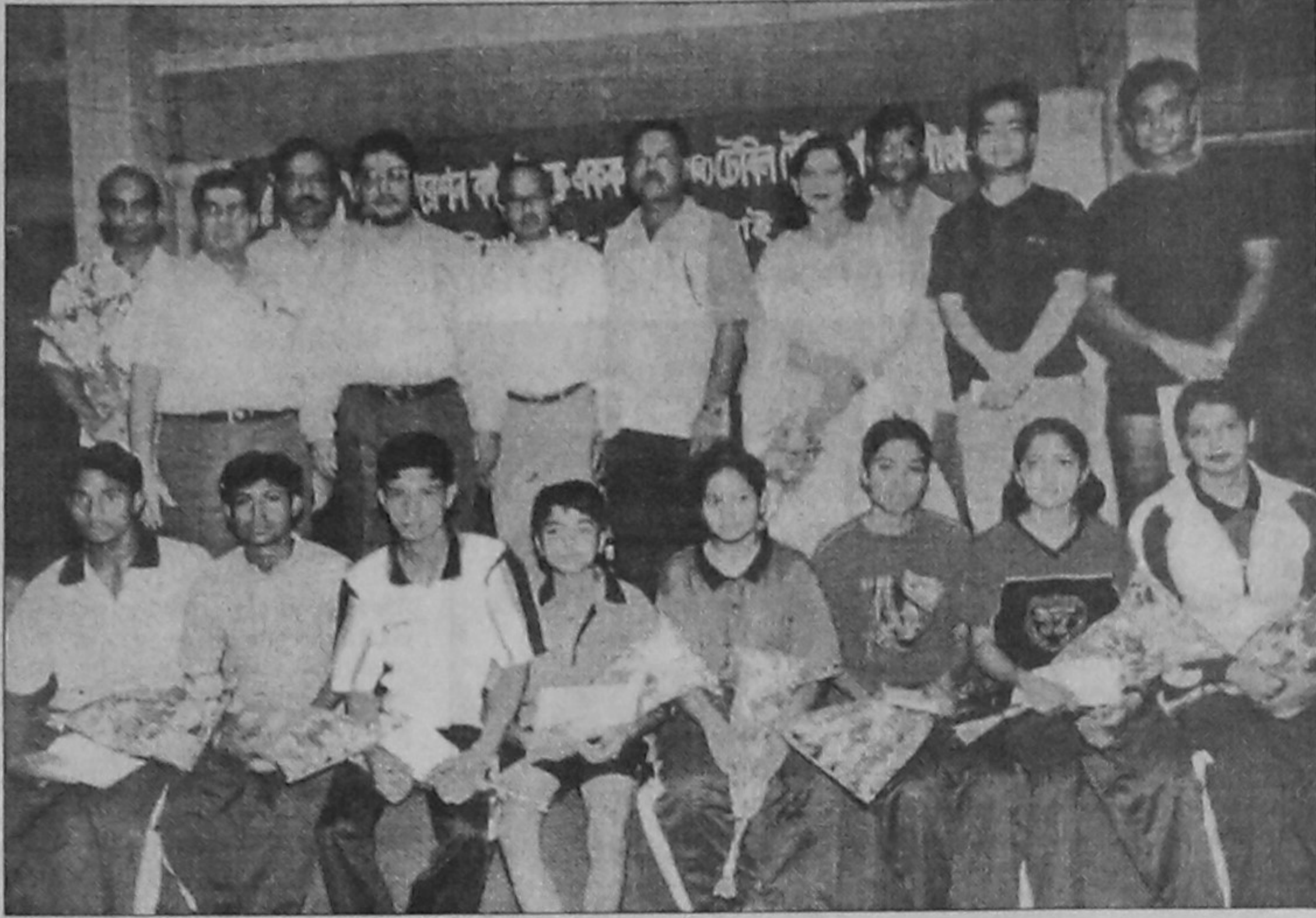
Winners of the Federation Cup Open Table Tennis tournament pose for photographs after the prize-giving ceremony at the National Sports Council yesterday.

REUTERS, Gstaad Alex Corretja is supporting the idea of Wimbledon starting a week later to ease the pressure on top players.