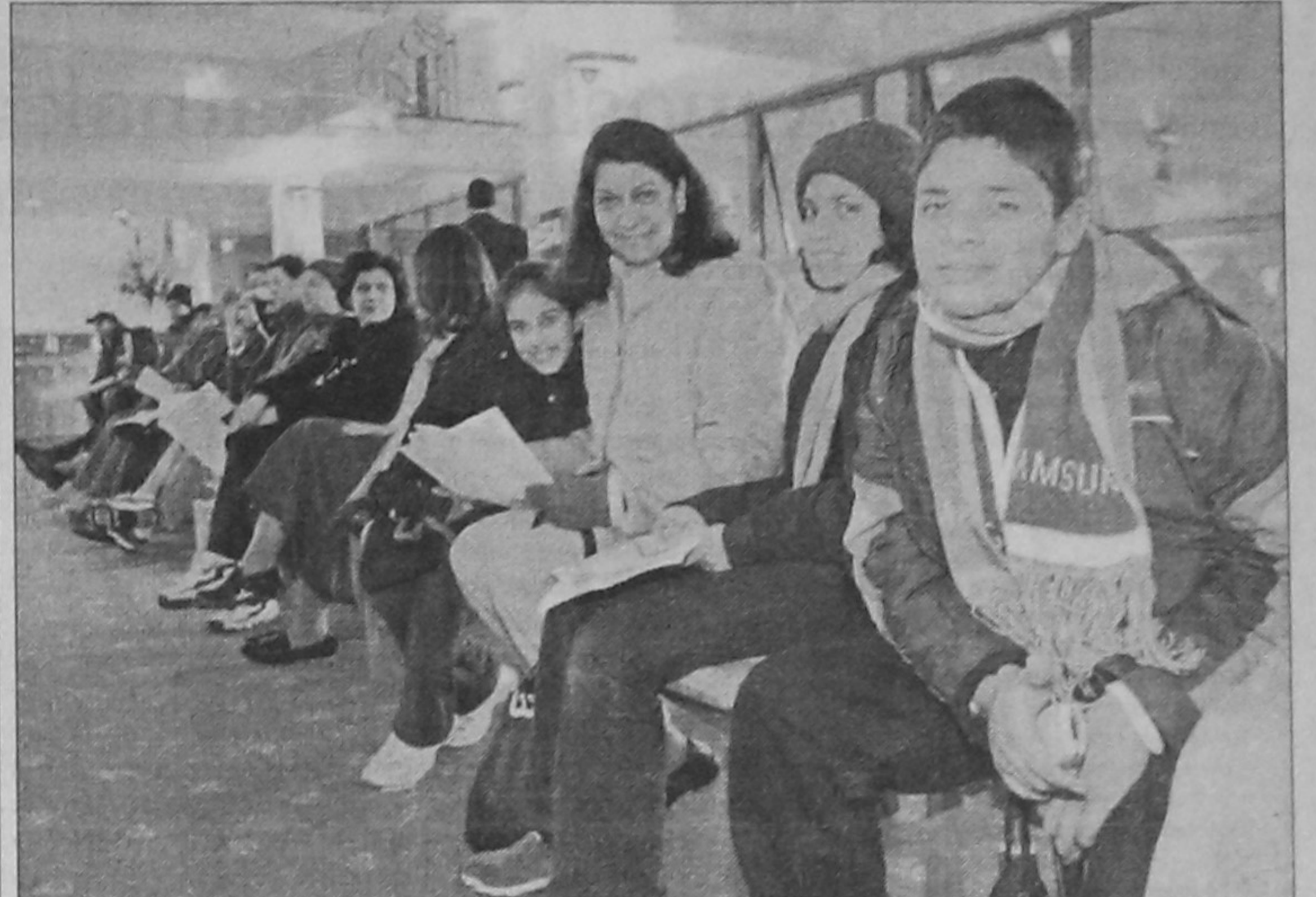
Fans in Cape Town, South Africa sit in a long queue to buy tickets for the cricket World Cup 2003 on July 15.