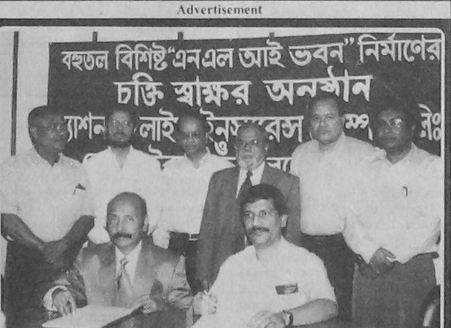
Agreement Signing ceremony for Building NLI Tower