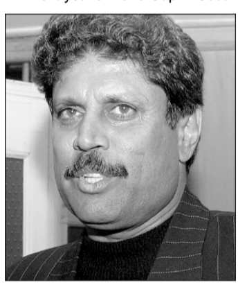
KAPIL DEV Africa.

Former Indian captain Kapil Dev believes they are only one player short of being serious contenders to win next year's World Cup in South