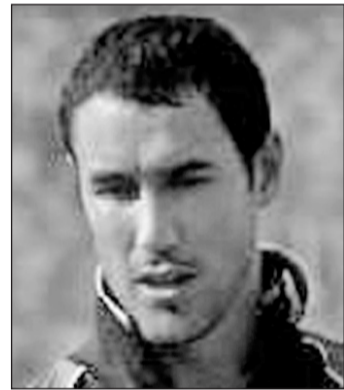
BEN HOLLOIAKE Hoolioake's county club, Surrey, said the 24-year-old all-rounder was an "unforgettable young man."

John Major, a keen cricket fan and a former president of