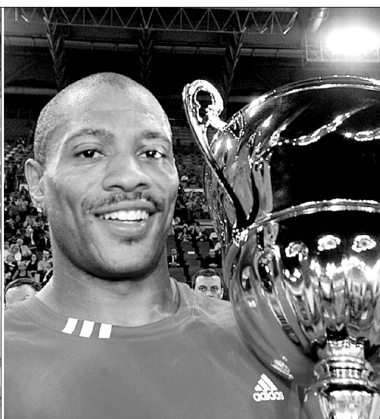
A combo picture shows American sprint queen Marion Jones (L) celebrating her 100m victory while world and Olympic champion Maurice Greene holding his trophy after winning the 100m dash in Rome's IAAF Golden League at the Olympic Stadium on July 12.