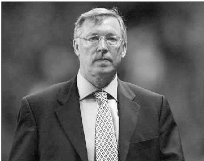
SIR ALEX FERGUSON

"With the quality and type of player we want to bring to the club