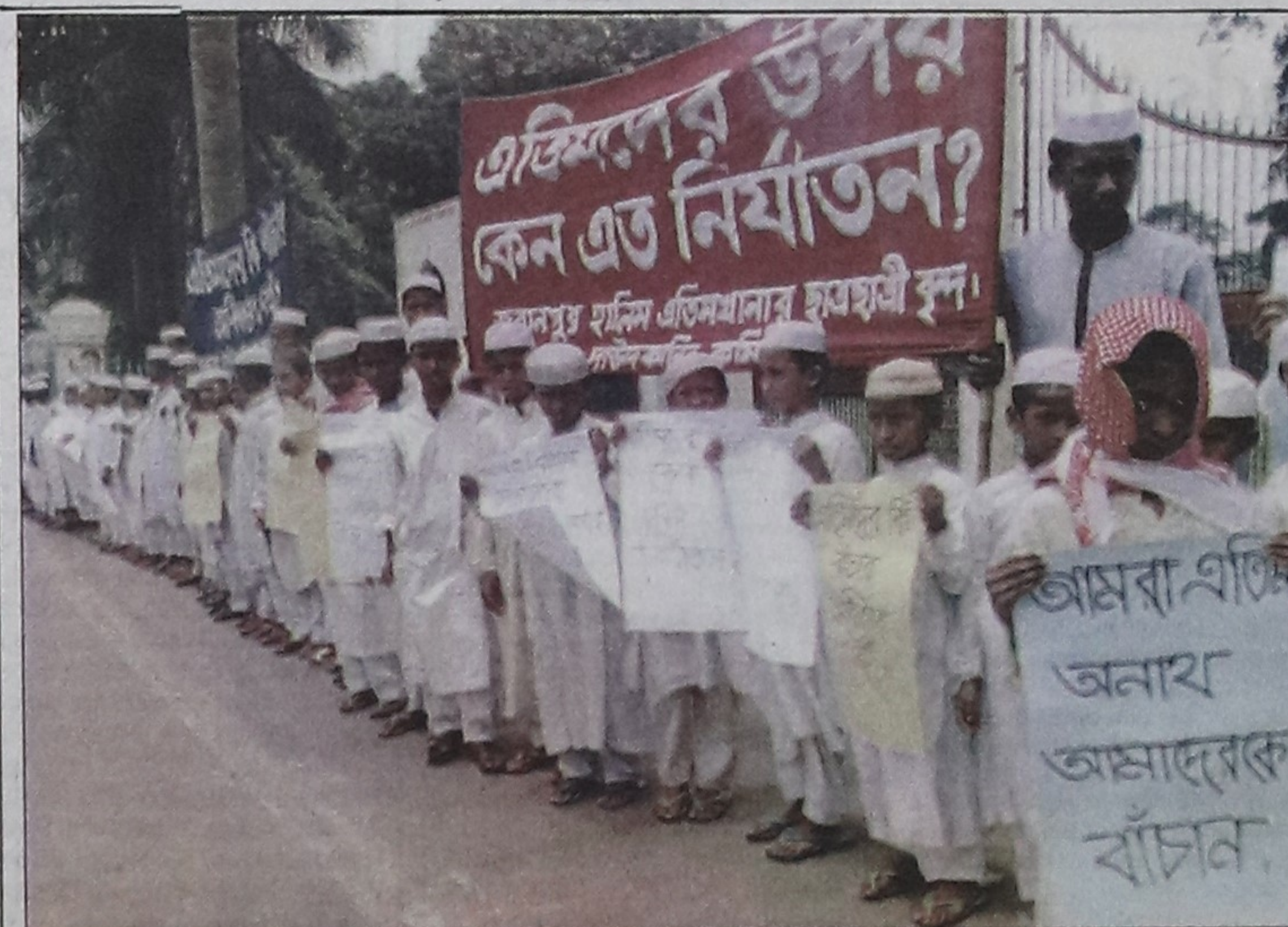
Students of the Jabanpur Halim Orphanage, Daudkandi, formed a human chain in the city yesterday demanding an end to repression on them.

Morshed Khan expressed satisfaction over various agreements between the two countries in the fields of defence, culture, civil aviation, health, maritime and transport.