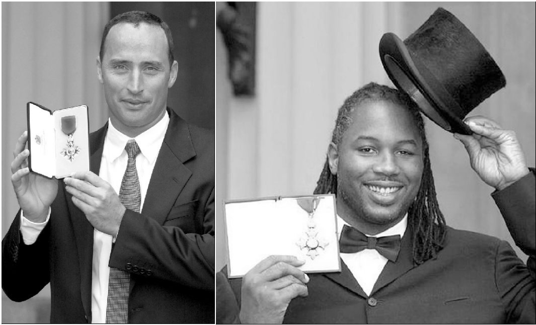
A combo picture shows England cricket captain Nasser Hussain (L) displaying his Officer of the British Empire (OBE) medal while world heavyweight champion Lennox Lewis showing off his Commander of the British Empire (CBE) medal at Buckingham Palace yesterday. Prince Charles, the Prince of Wales, awarded them with the medallions.

Result: India won by 63 runs. Man-of-the-match: Sachin Tendulkar.