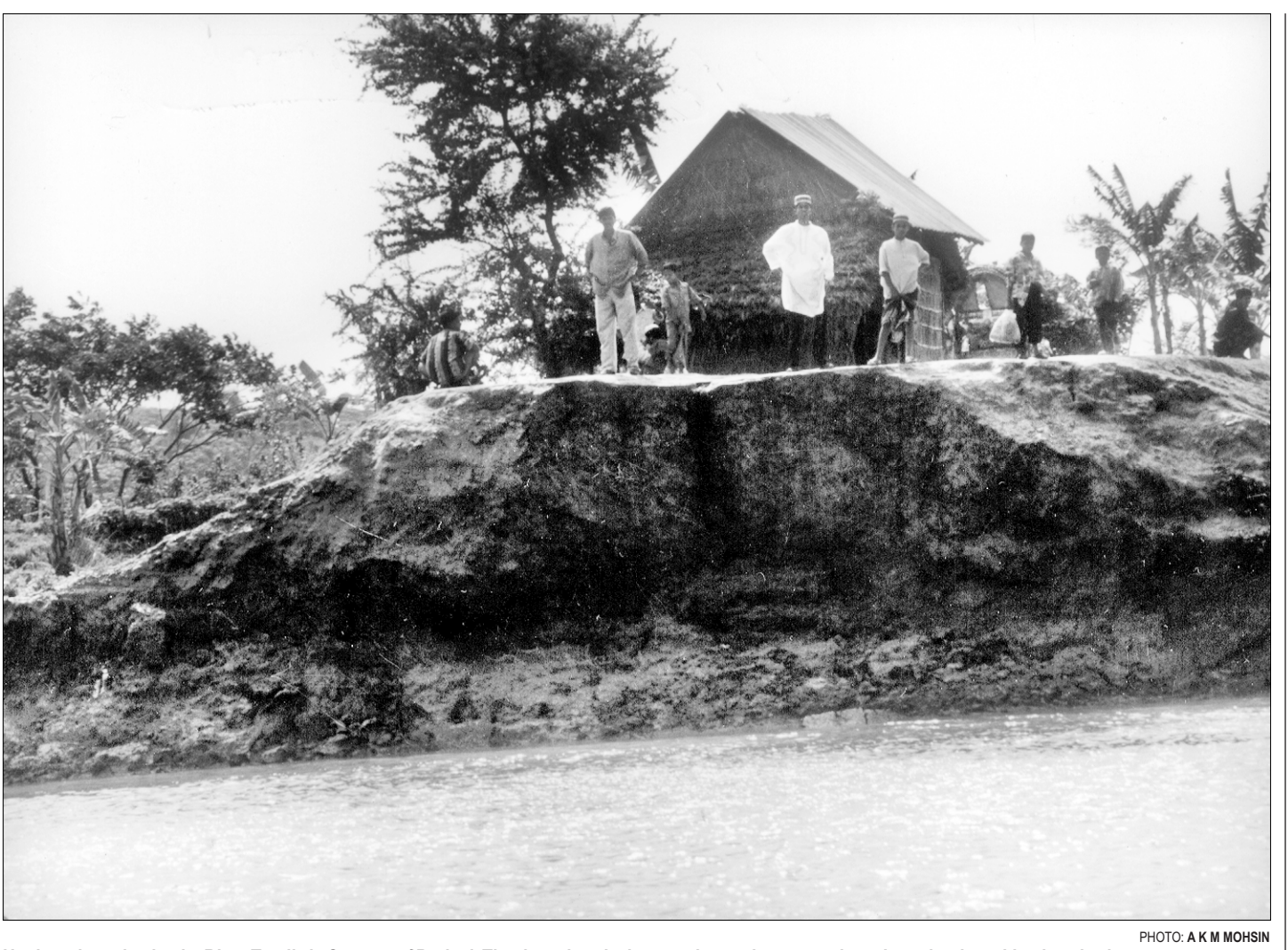
Unabated erosion by the River Tetulia in Sreepur of Barisal. The river already devoured many homesteads and croplands making hundreds pauper.

The Samity launched its programme in 1982-83 fiscal and gave 51,162 power connections installing distribution lines over 1776 km areas. The power connections vere given to houses, shops, factories and irrigation projects in 350