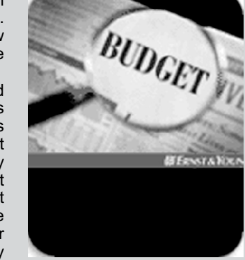
Whose budget is it anyway?

Every year in the name of the so-called system losses crores of taka are theft by tampering electric meters or other ways with the help of the