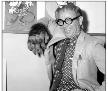
Kimball wears a 'hairy hand'

WARD Kimball, one of the world's pioneering cartoon animators who created such classic Walt Disney characters as Jiminy Cricket, died on Monday at the age of 88, Disney executives said.