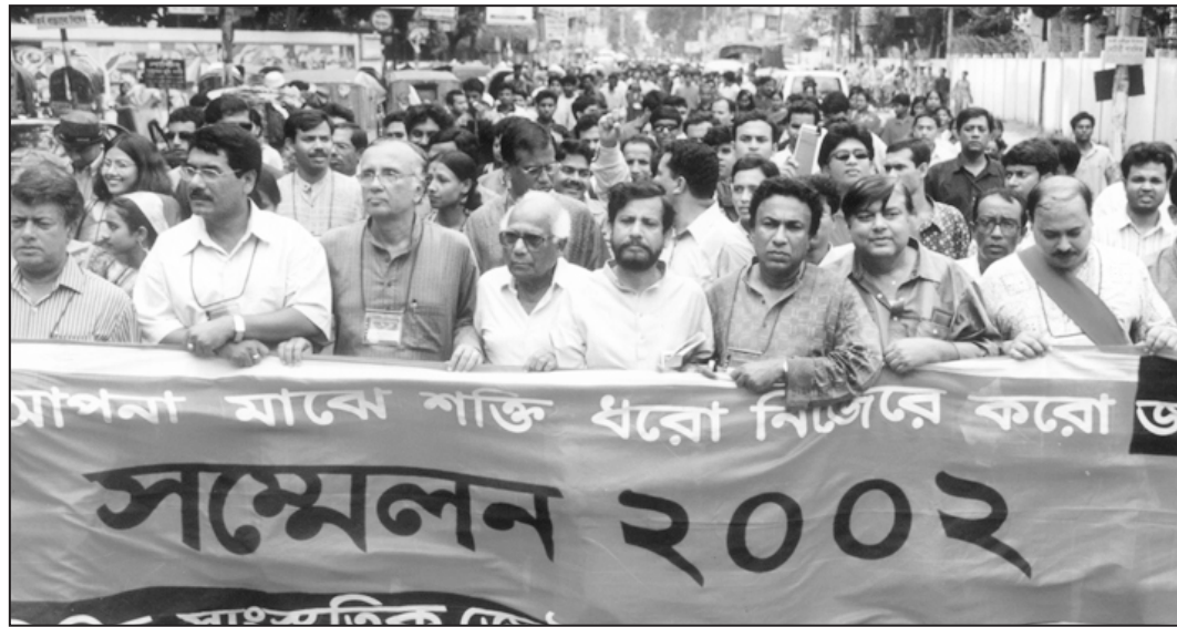
Rally of the Jote in progress

FIFTH council convention of Sammilita sangskritik Jote, a combined body of the country's left leaning cultural organisations, was held last Friday at the city's Mahila Samity Auditorium.