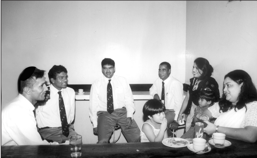
DON'T COME BACK EMPTY-HANDED! (L) Bangladesh skipper Khaled Mashud, Aminul Islam, Akram Khan and Enamul Haque spending some time with wives and children at the Zia International Airport(ZIA) canteen. (R) Ace batsman Habibul Bashar kisses his baby son while his wife watches at the ZIA before departing for Sri Lanka yesterday.