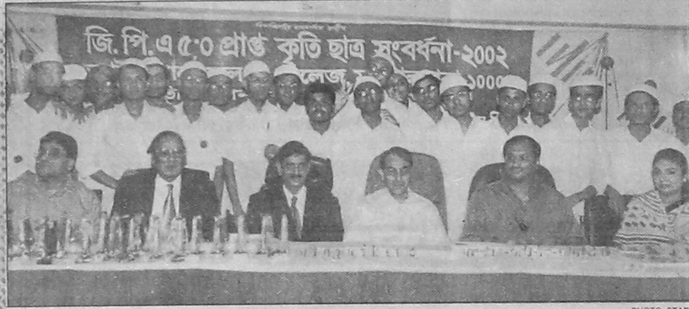
A reception was accorded to the meritorious students, who scored GPA-5 in this year's SSC examinations from Ideal School and College, on the school premises in the city yesterday. The students pose for photographers with Housing and Public Works Minister Mirza Abbas and other guests at the ceremony.