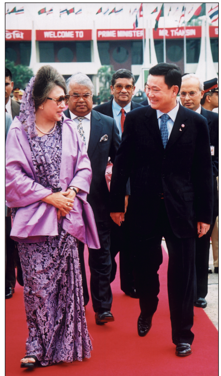
Prime Minister Khaleda Zia sees her Thai counterpart Thaksin Shinawatra off at the Zia International Airport yesterday. Shinawatra flew back to the Thai port city of Chiang Mai with a stopover at Chittagong.