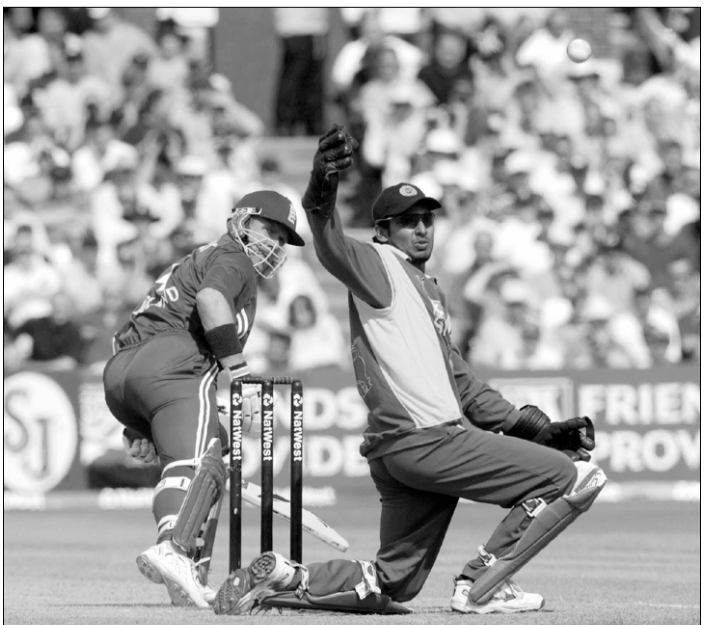
England's Alec Stewart waits to see if the ball reaches the boundary as Sri Lankan wicketkeeper Kumar Sangakkara looks on during the NatWest Series match at Old Trafford on July 7.