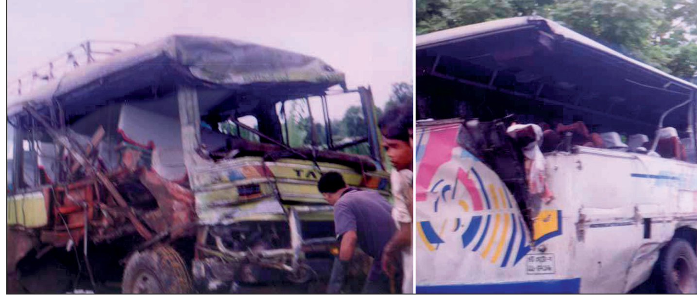
The crumpled passenger buses after the collision at the Kismatpur point on the Dhaka-Chittagong highway yesterday that killed three and injured 14