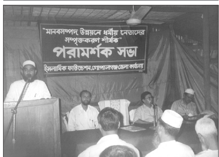
An Imam addressing at a seminar titled "Involving Religious Leaders in Human Development" at the office of Islamic Foundation, Gopalganj recently.