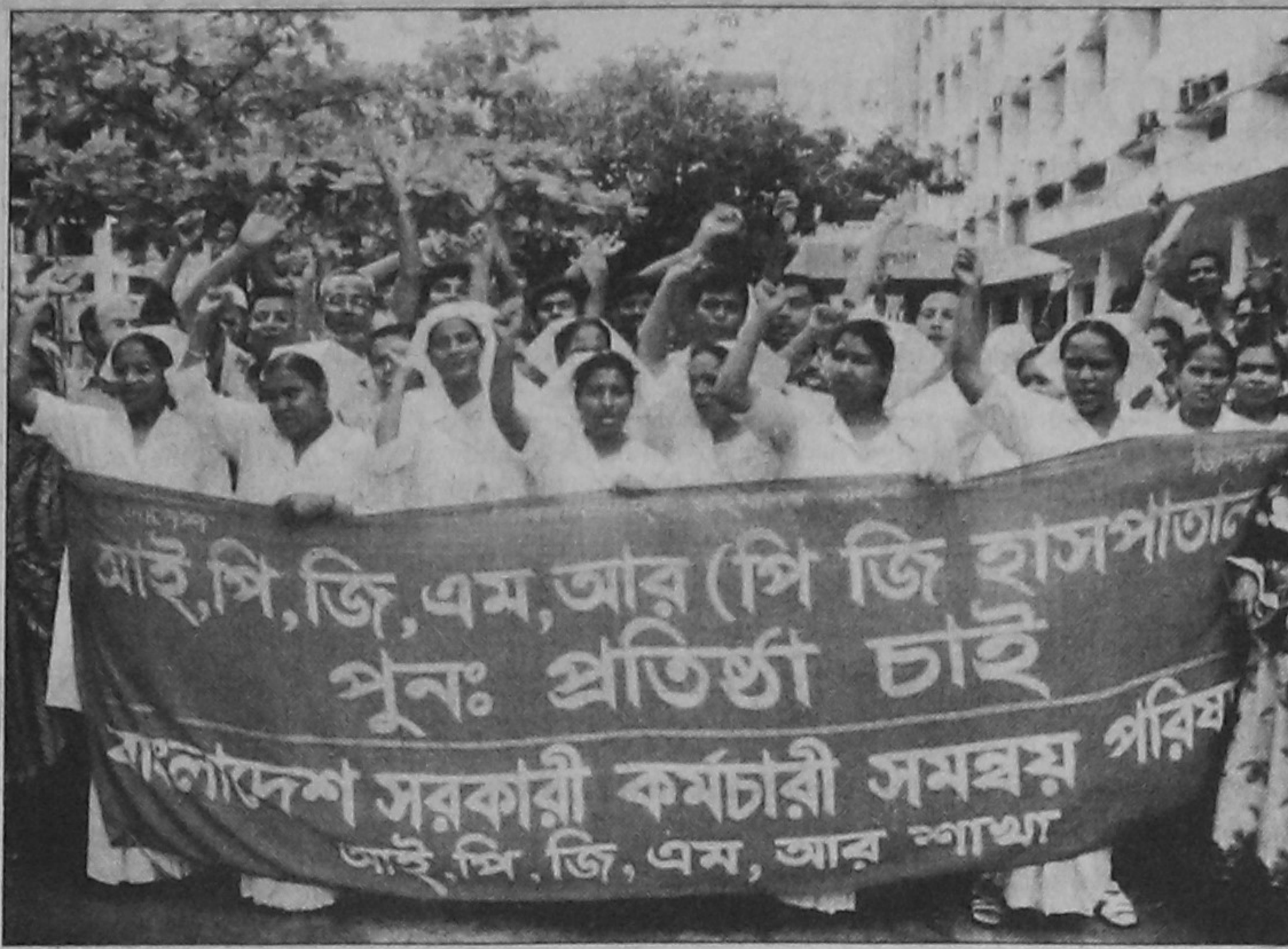
The Bangladesh Government Employees' Coordination Parishad, IPGMR unit, staged a demonstration in the city yesterday demanding revival of the PG Hospital.

The judge court passed the order following a criminal appeal filed by the defence lawyers on June 20 on behalf of Dr Alamgir against the rejection order of the CMM's court.