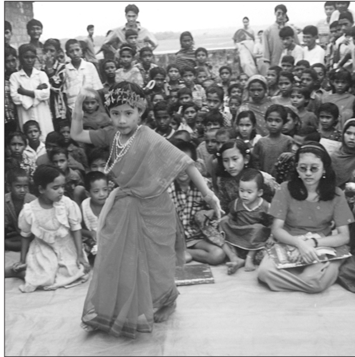
A young performer