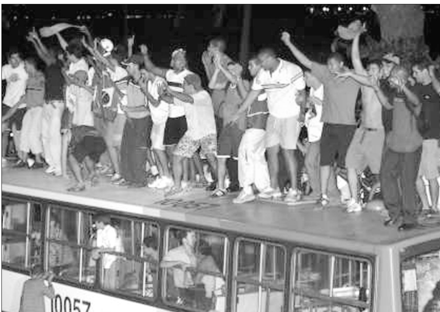
PARTY, PARTY AND MORE PARTY: Brazilian fans sing and dance on top of a bus while roaming around in Rio de Janeiro on July 3 to celebrate the nation's becoming the world champions for a record fifth time.