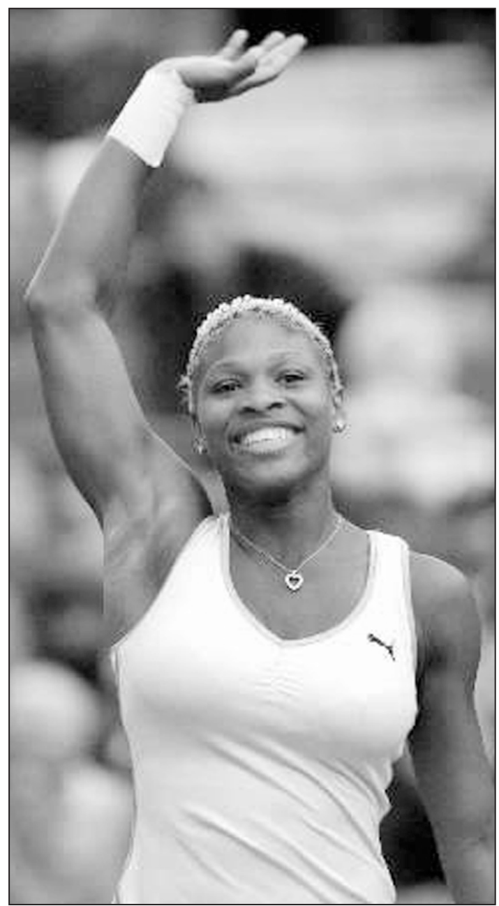
American Serena Williams waves to the crowd after she won her match against Daniela Hantuchova of Slovakia on July 3.

On grass, she came into Wimbledon having reached the semifinal at Eastbourne.