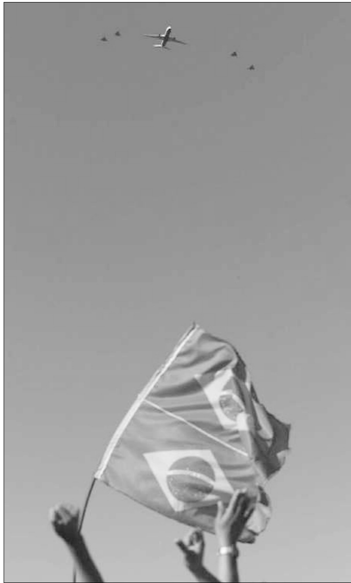
STATE WELCOME: Four Brazilian airforce fighter jets escort the Boeing 767 carrying the World Cup champion squad in the skies over Brasilia yesterday.

blazed streets of Brasilia and bouncing fans clamored for a wave or a wink from the man they call "the phenomenon."