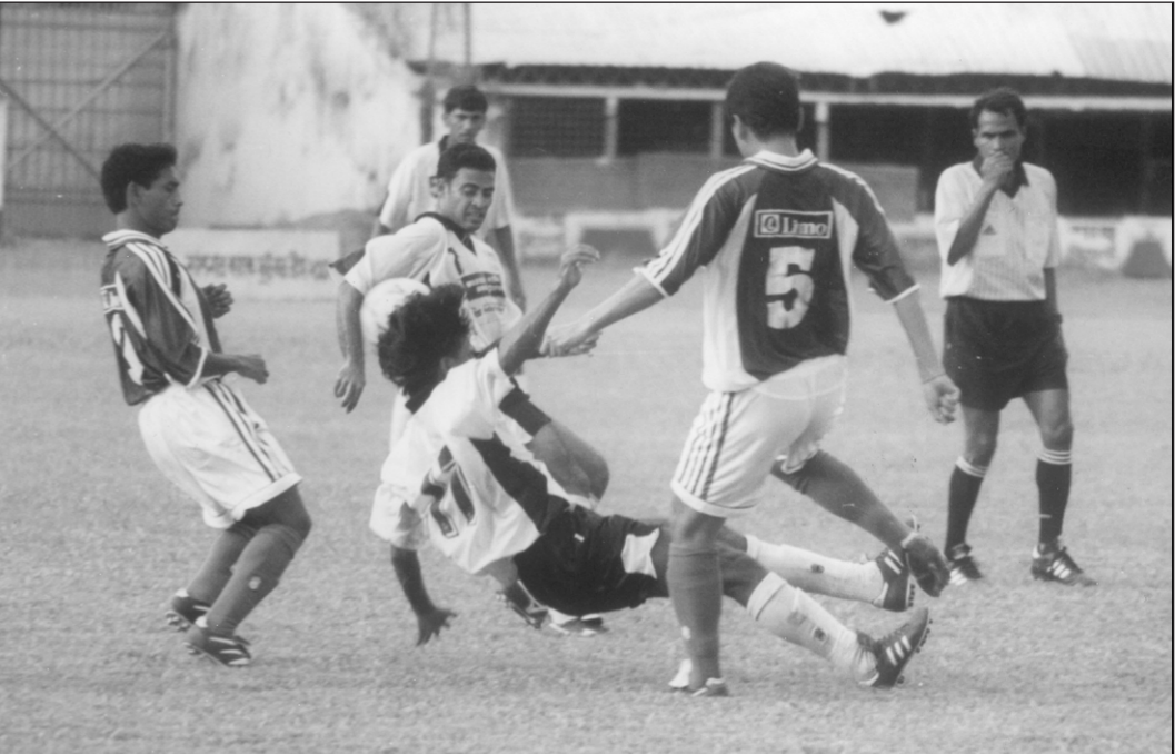
Action from yesterday's National Bank Premier Division Football League fixture between Arambagh Krira Sangha and Badda Jagarani at the Bangabandhu National Stadium.