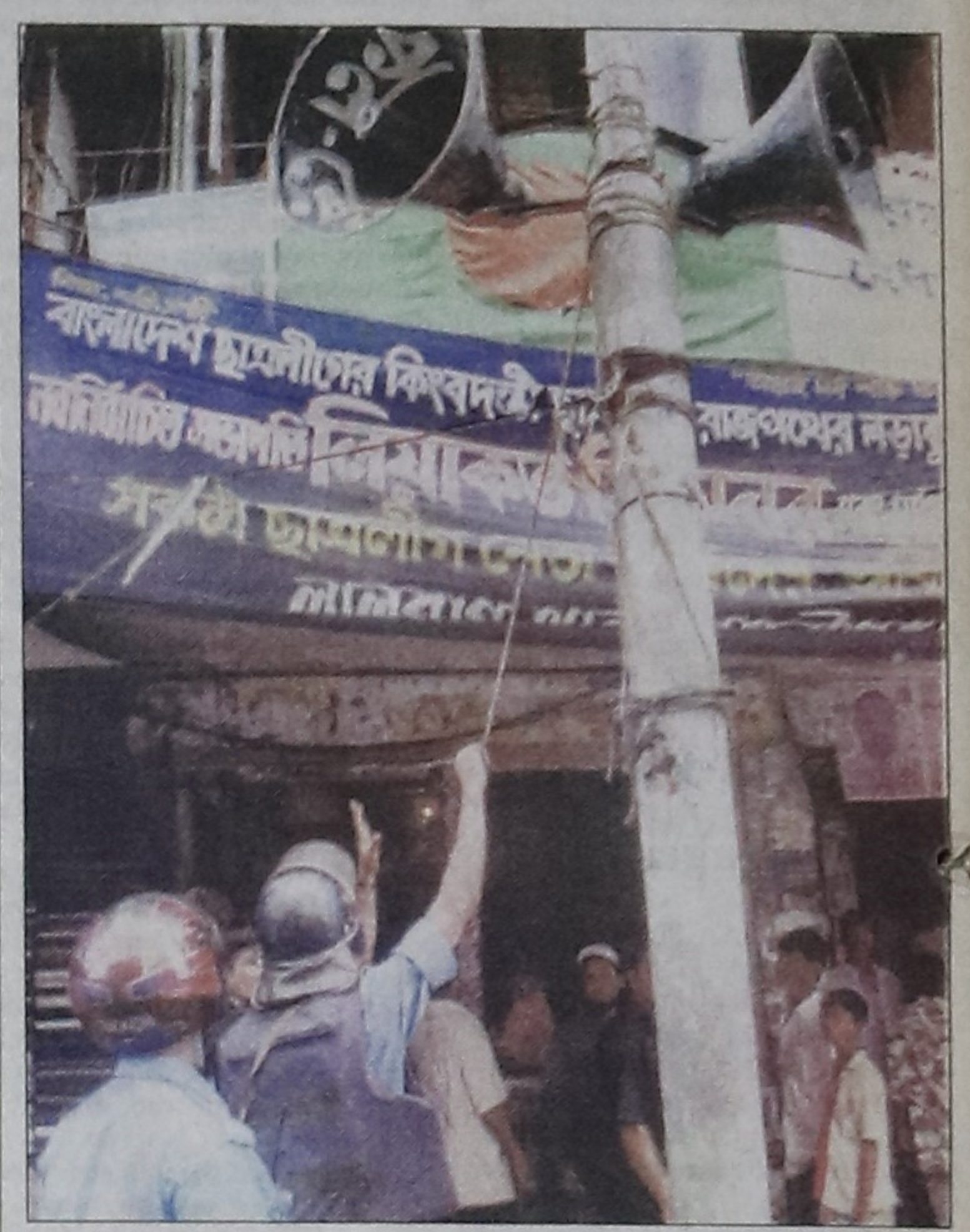
A police officer disconnects the cable of a loudspeaker at an Awami League protest rally at the party central office on the Bangabandhu Avenue in the city yesterday.