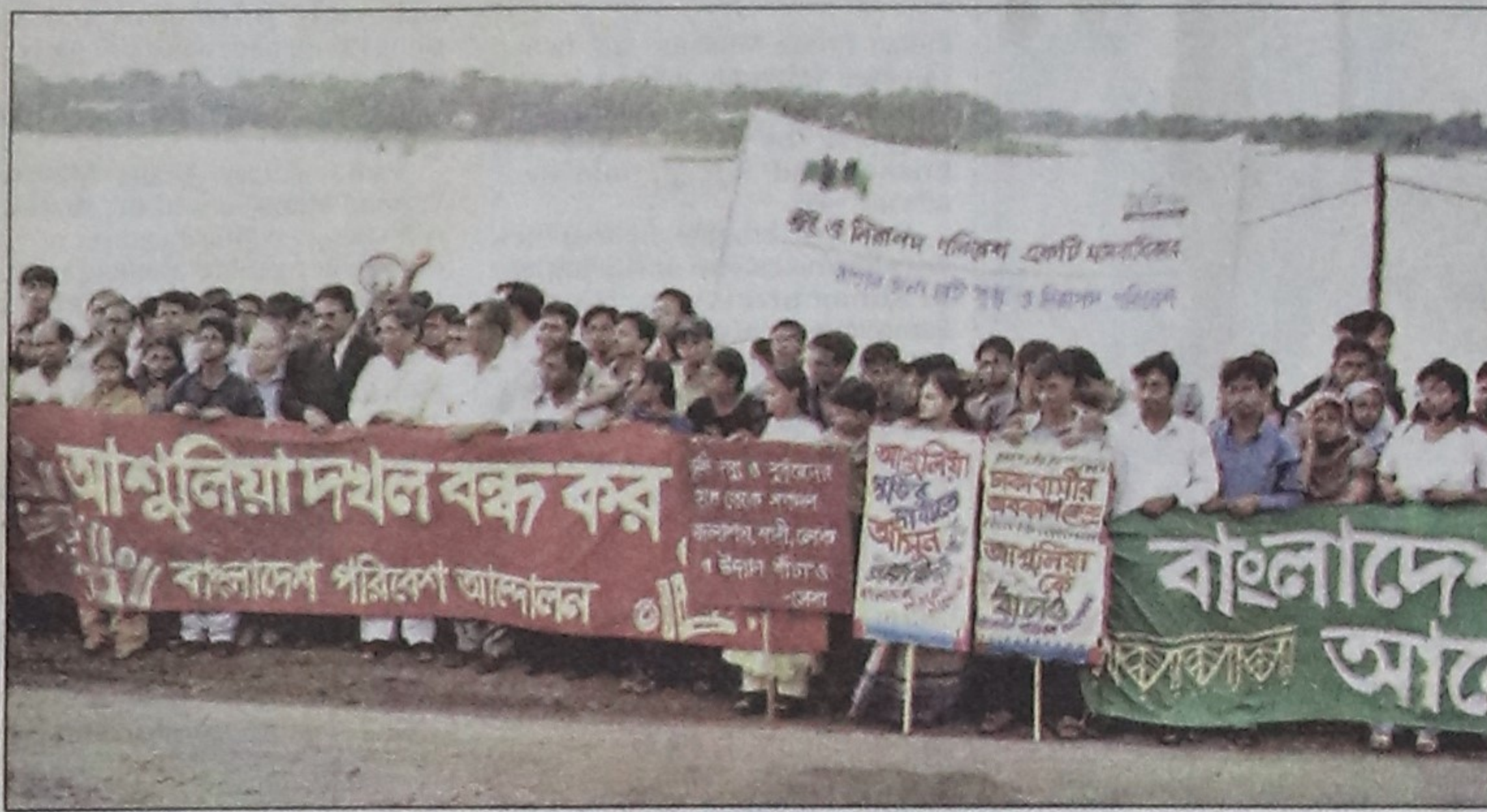
Some 200 teachers, students, environmentalists, NGO workers and conscious citizens under the banner of Bangladesh Paribesh Andolon staged a protest rally at Ashuliya in the city yesterday.