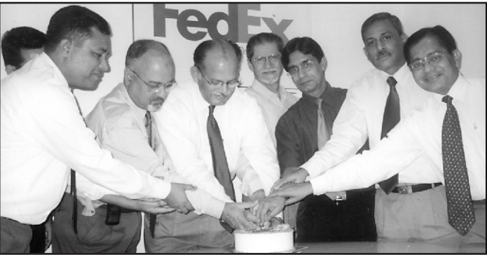
Photo shows the management of Bangladesh Express Co Ltd, licensee of Federal Express Corporation, celebrating the company's 10th anniversary in the city recently.