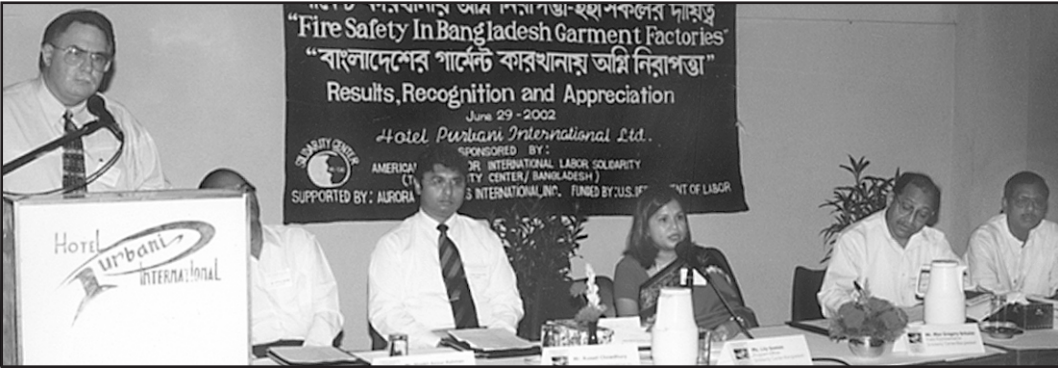
A seminar on 'Fire Safety in Bangladesh Garment Factories' organised by American Centre for International Labour Solidarity was held at a city hotel on Saturday.