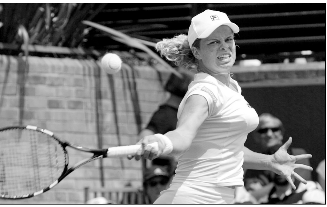
Belgian Kim Clijsters in action against US Samantha Reeves in the first round of Wimbledon Tennis Championships in London on June 25. Clijsters won 6-2, 7-6.

"The team has not been that good for a year. Their defeat in Chile, a draw with Russia and another defeat to Belgium prove it."