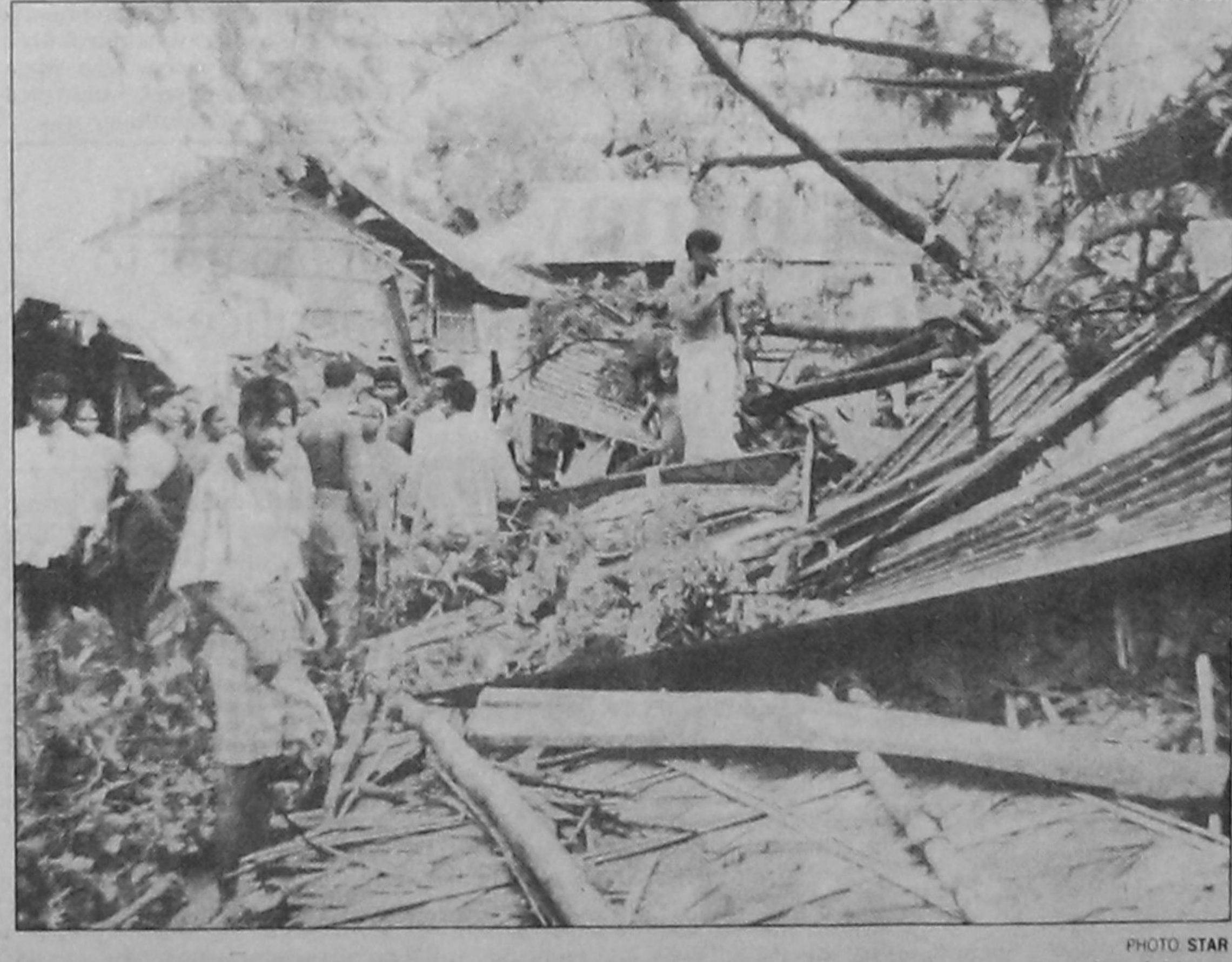
A number of kutcha houses blew down during a storm at Tallapara in Fatulla, Narayanganj, on Tuesday night.