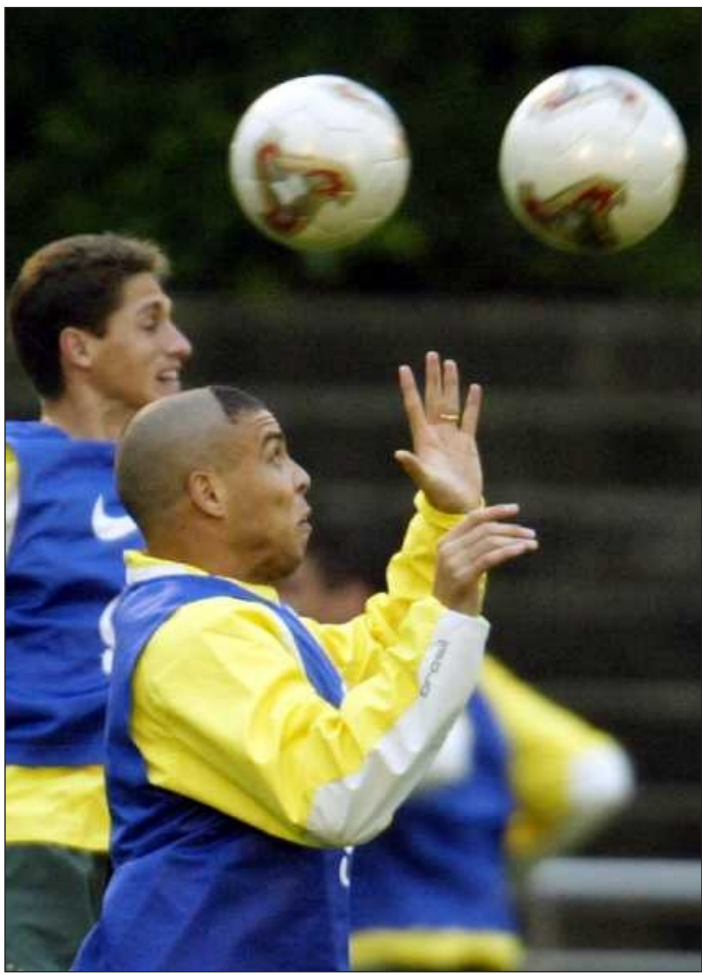
ONE HEADED GOAL COMING? Superstar Ronaldo and Edmilson (L) practice heading at Saitama yesterday.