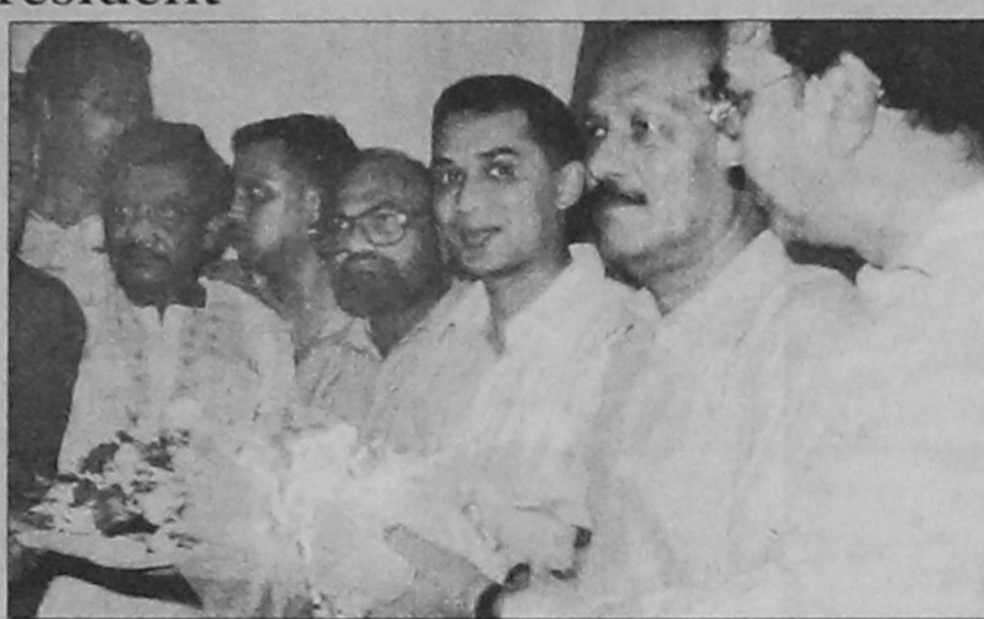
The son in the wings