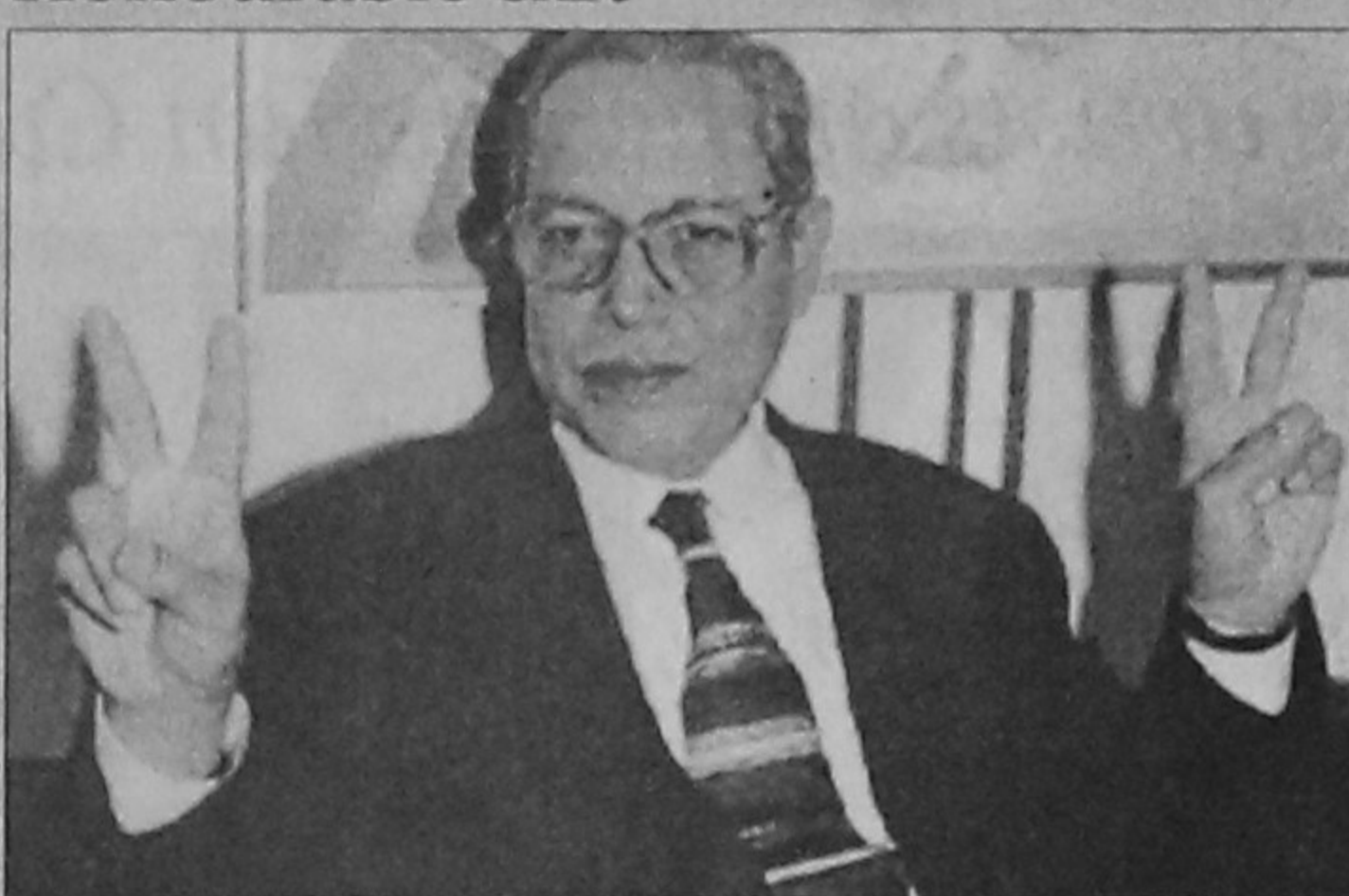
Good-bye presidency, hello patients