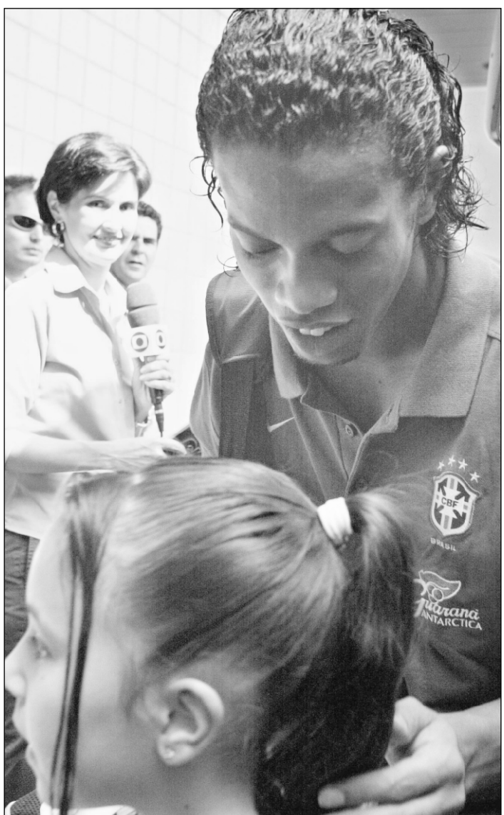
YOU COULD TRY MY HAIRSTYLE! Brazilian sensation Ronaldinho Gaucho pats a little Brazilian girl while checking out of the Grand Hotel in Hamamatsu yesterday.

Cafu spoke to me and said 'Don't worry, we're going to win this game for you now'. I'm happy that they did.