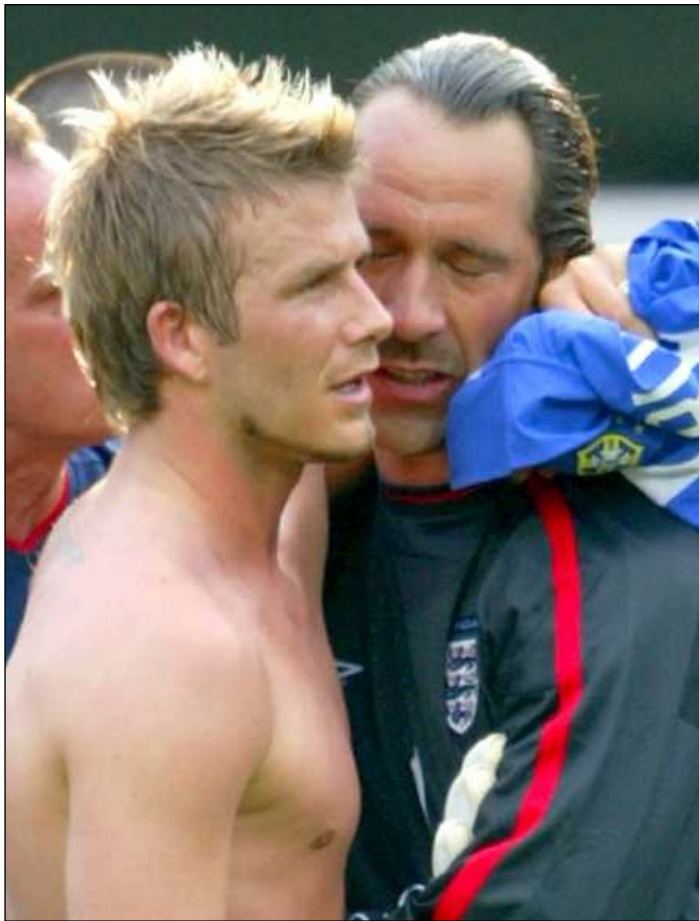
WE ALL PLAYED BADLY: England captain David Beckham (L) comforts custodian David Seaman after the match against Brazil yesterday.