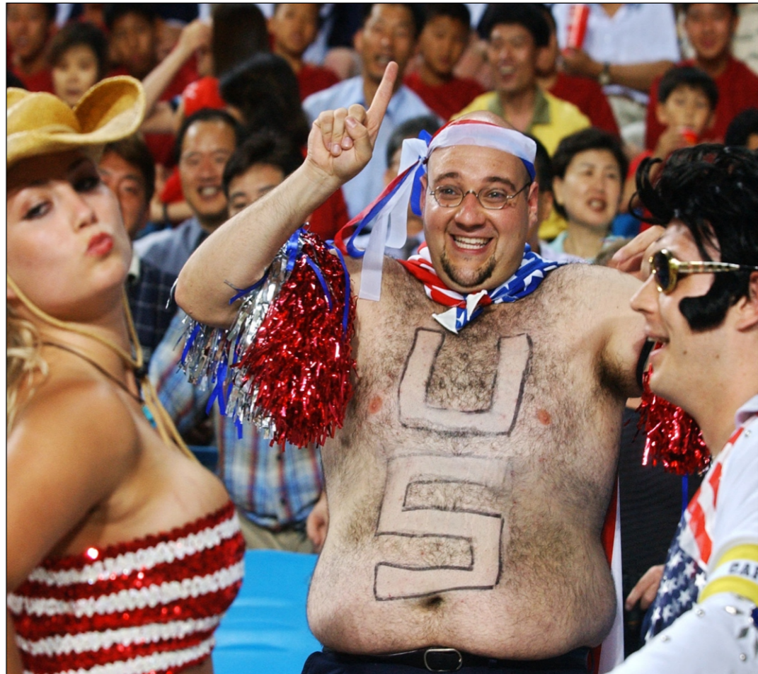
ELVIS, AMERICAN BEAUTY & FAT BOY SLIM WERE THERE! Three United States fans make their presence felt at Ulsan during the quarterfinal against Germany yesterday.