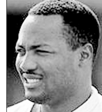
BRIAN LARA until the St Vincent game because you need full extension of the arm. But I put one of these through backward point on Sunday which was very pleasing," Lara said. "In cricketering terms I am about 90 per cent but you can see just by looking at it that the injury and arm extension are still only about 75 per cent," he said holding out his left arm.

confidence in both mental and physical terms," Lara said. While not a classic Lara innings, his 47 in the final one-day game in St Vincent on Sunday was another job well-done. Lara also unleashed in that match the cuts and pulls that have been absent from his repertoire since he sustained the elbow injury. "I had not played a cut shot at all