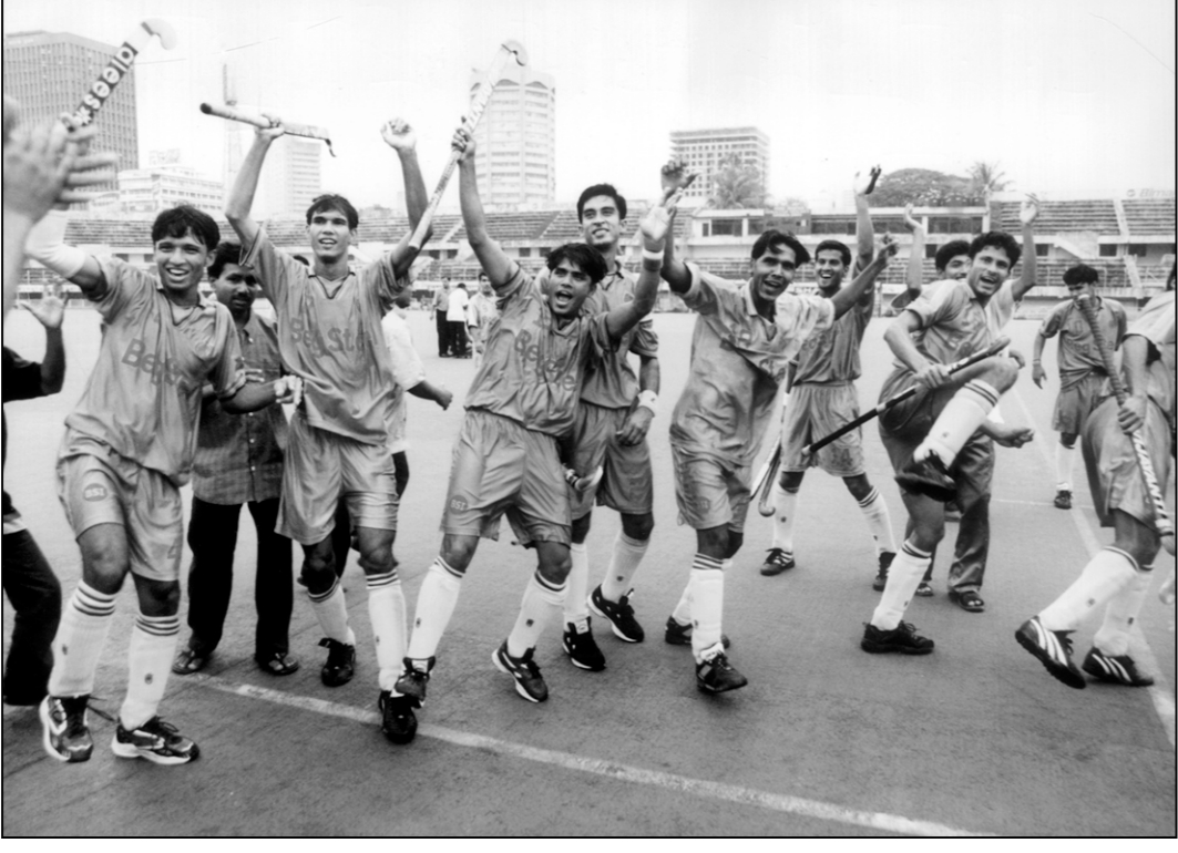
THE PICTURE SAYS IT ALL: Abahani stick-wielders party after winning the Green Delta Premier Division Hockey League title at the Maulana Bhasani National Stadium yesterday.