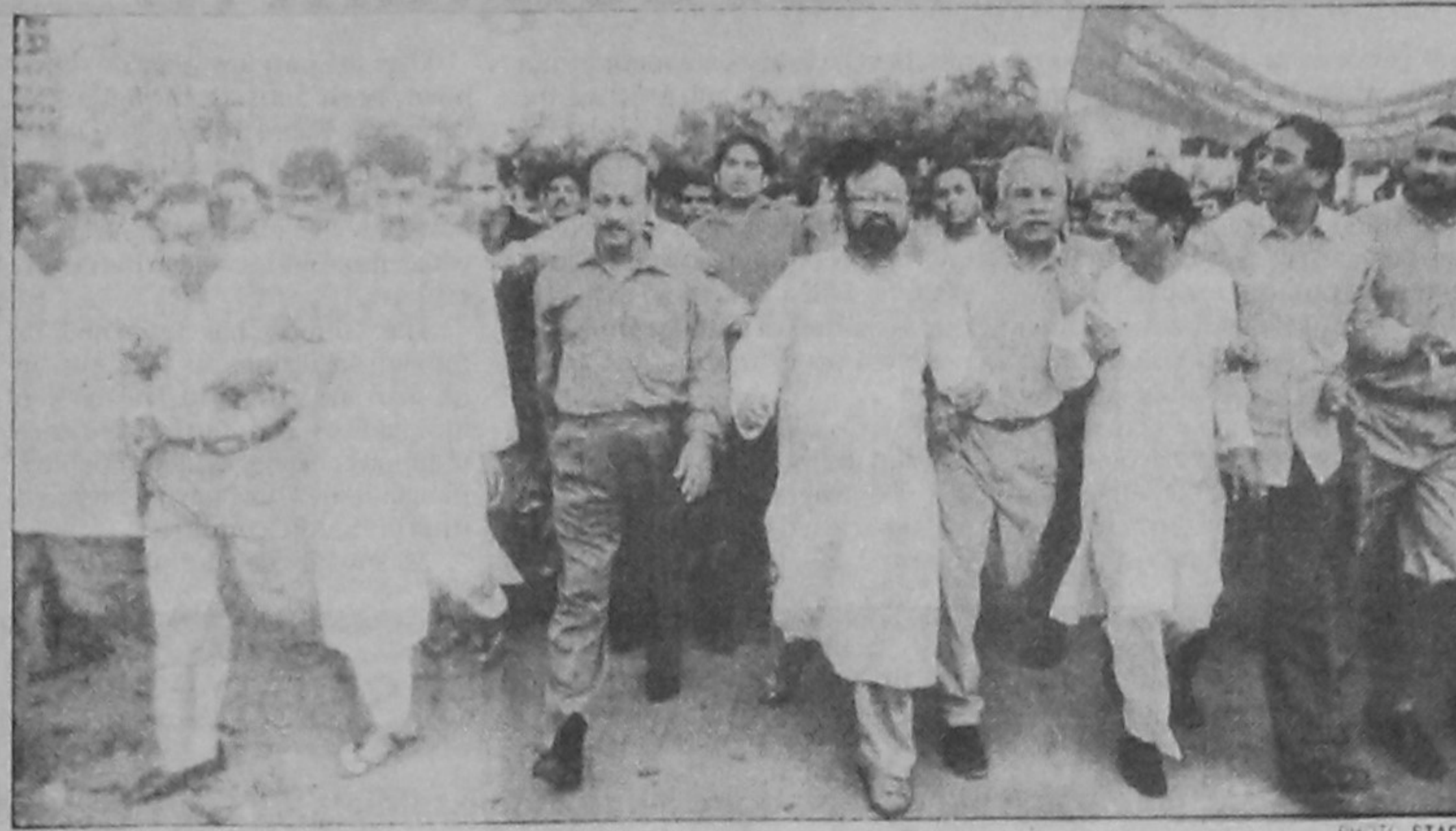
BNP took out a procession in the city yesterday protesting Leader of the Opposition in parliament and Awami League chief Sheikh Hasina's remarks about late president Ziaur Rahman.