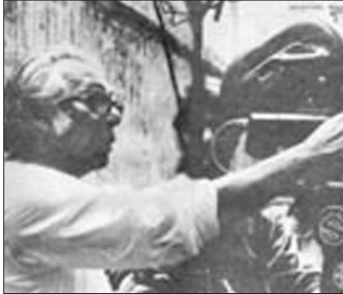
The filmmaker: Mrinal Sen

An "accident," as Mrinal Sen calls it, happened when he was in college. A voracious reader, he would regularly frequent the