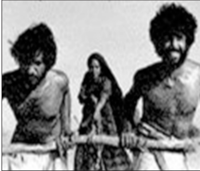
Still from Genesis

Zahir Raihan Film Society has come up this time with the retrospective of films made by one of the "Trio" Mrinal Sen. In the first part of the series the film club is screening five films at the High Commission of India Cultural Centre at 754 Satmasjid Road, Dhanmondi. The session started on Friday, June 14 and will be over on Tuesday, June 18. A film will be screened everyday at 6:30 PM. Mrinal Sen was born in 1923 in Faridpur in the then British India (now Bangladesh). He was sent to Kolkata to do his graduation in Physics in 1940. While studying