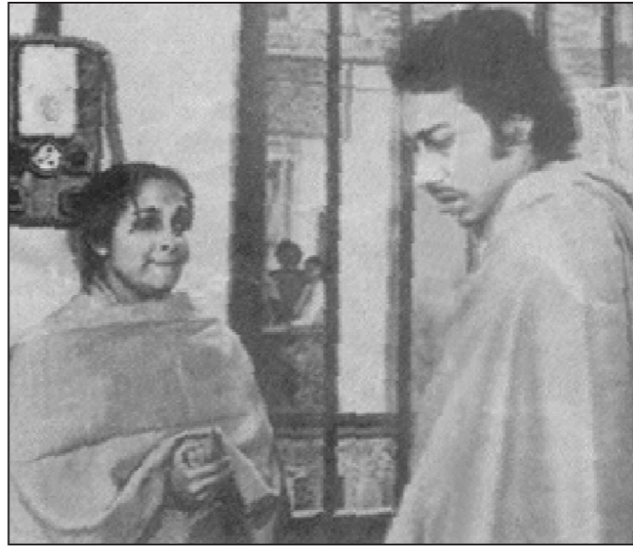
Still from Kharij