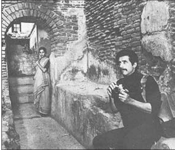
Still from Khandahar

His second film "Neel Akasher Nichey" ("Under the Blue Sky," 1959) was banned for two months by the government, but didn't break through until "Akash Kushum" ("Up in the clouds," 1965), which generated a passionate with Satyajit Ray. His "Bhuvan Shome" (1969), made in Hindi, was a commercial success in Mumbai and is said to have pioneered the New Wave in Indian cinema, generating the 1970s debates about low-budget alterna-