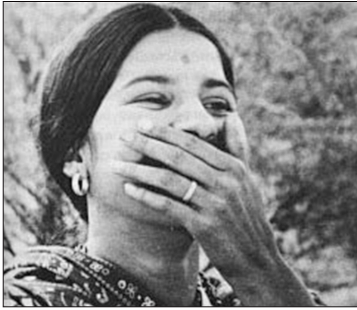
Still from Bhuvan shome

"Antareen" ("The confined", 1993) is his last film to date. Since then he made no new films. In answer to why he isn't making any films, Sen answered that he lost the inspiration to make films. Sen is now leading a retired life in Kolkata. His films won many awards at home and abroad. This is the first part of the Mrinal Sen Retrospective. Other parts will follow this one.