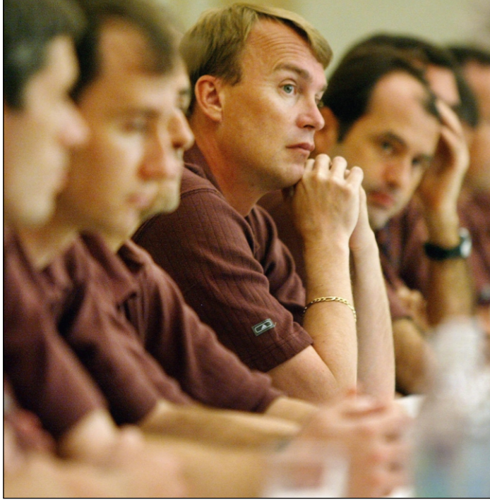
REFS' RESOLVE TESTED: Slovakian referee Igor Sramka (C) and fellow FIFA Referees' Committee members at a press conference in Tokyo yesterday.