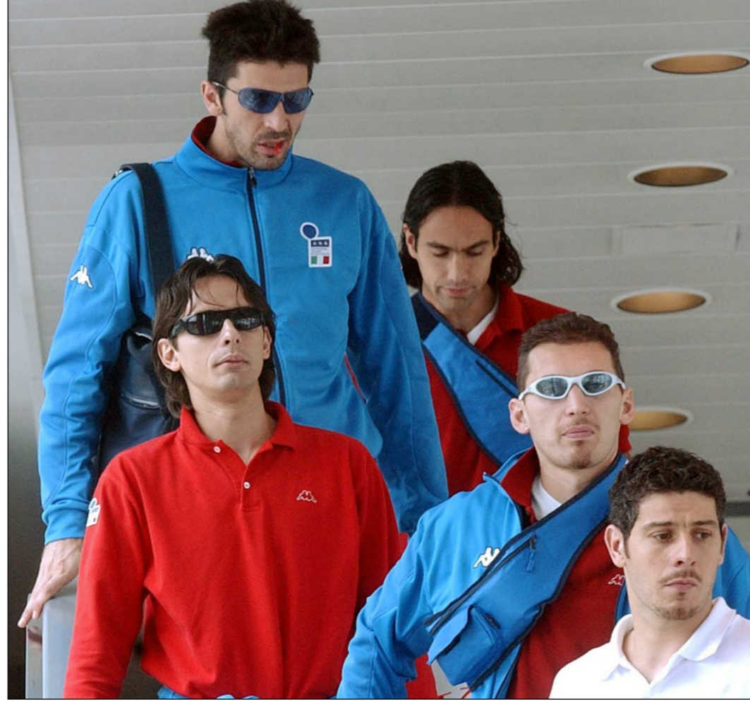
GOOD LOOKS NO GOOD! Members of the Italian team (L-R) Filippo Inzaghi, Gianluigi Buffon, Alessandro Nesta, Christian Abbiati and Francesco Toldo arrive at Incheon airport yesterday to catch a flight home.