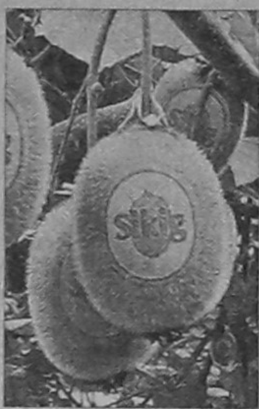
Budget: Fruits of frustration

I don't have an economics background. So, I admit that I do not have the knowledge necessary to understand national budget.