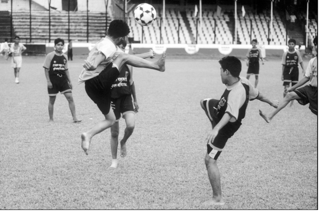
As part of the FIFA declared Juvenile Football Day on June 19, Bangladesh Football Federation and UNICEF jointly organised a day-long competition at the Bangabandhu National Stadium yesterday. Picture shows Prantik Krira Chakra and Dragon Krira Chakra players fighting it out in the middle.

Result: Pakistan won the match by 91 runs and series 2-1. Man-of-the-match and man-of-the-series: Shoaib Akhtar.