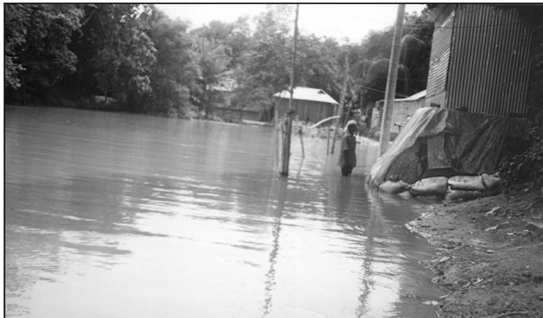
The inhabitants of second lane of Muhmudpur area in Sirajganj Municipality have been marooned by water of recent rainfall. Earlier, construction work of a pucca road started in the area at a cost of Tk 5 lakh, but the work was shelved half-way. The municipality authority should take immediate steps in restarting the unfinished work and mitigate the sufferings of local people.

Local people and suffering patients have urged the authorities concerned to take immediate steps to mitigate the suffering of the patients to ensure healthcare facilities to all.