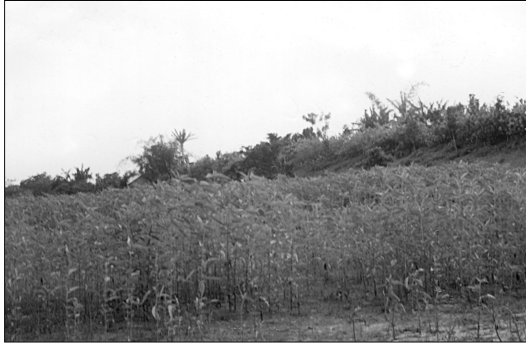
A jute field at Char Gobindapur in Sadar upazila in Mymensingh. Farmers are now taking more interest in cultivation of jute because of ban on polythene bags all over the country.

The sources said, 125 MT of BR-11, 10 MT of BR-30 and 30 MT of High Yielding Variety (HYV) seeds will be distributed among the growers at the rate of Tk 16.50, Tk 14.50 and Tk 14.50 per kg respectively.