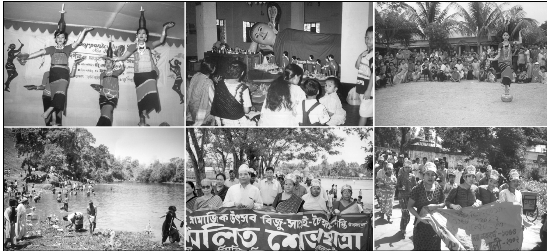
The Marma community observed their traditional Baisabi festival recently. They observe the festival annually for their peace and prosperity. (Top left) Marma children perform their bottle dance, (middle left) hill people pray for peace and prosperity (right) a large number of people enjoy the pitcher dance on the auspicious occasion. (Bottom left) Marmas take bath in Nunchhari pond on the first day of the festival to get rid of kinds of sin, (middle right) people of all communities irrespective of caste and creed parade the streets in Chittagong Hill Tracts (CHT) in a colourful procession on the occasion of Baisabi and (right) a colourful rally of the Marma community led by young Marma women on the occasion.