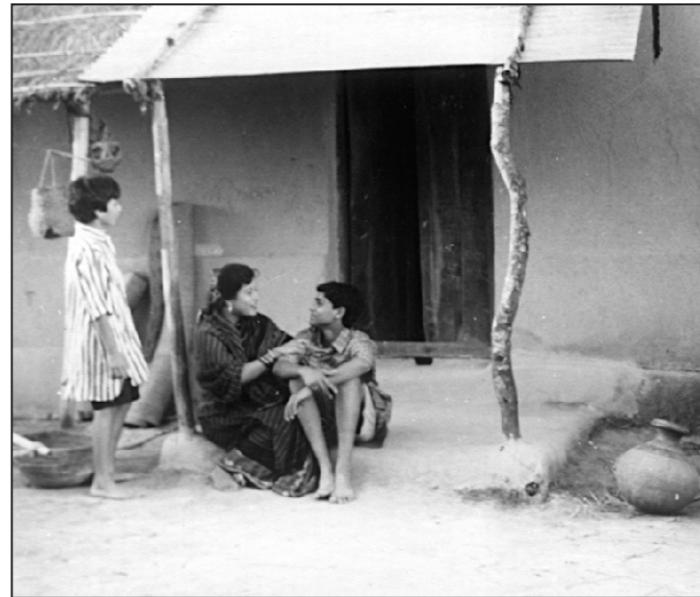
Scene from 'Janani'

the current president of Canada-Bangladesh Trade Promotion Center Inc. has expressed his willingness to arrange financier and source of sponsorship from abroad. 'Janani', a film that would