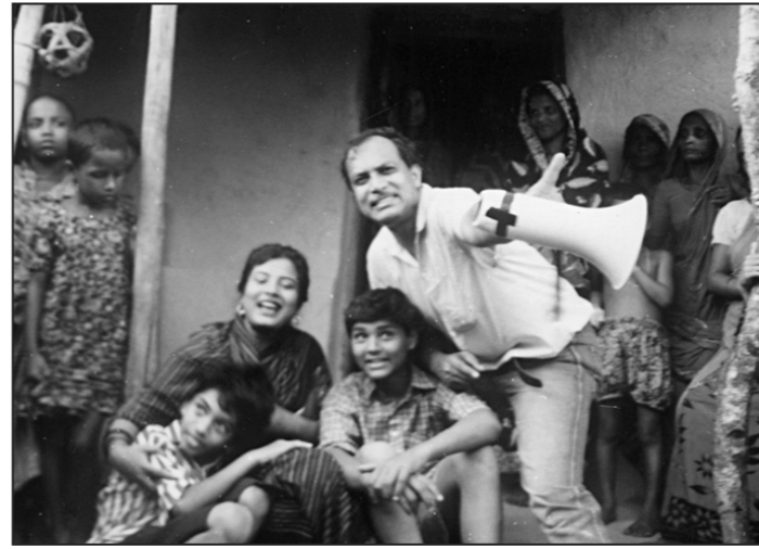
The producer spends some light moments with performers in between shooting