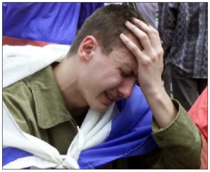
WHY US? A devastated Russian fan at Moscow yesterday after watching his team go out of the World Cup.

Thousands of Russian soccer fans watching the crunch World Cup tie against Belgium on a giant screen opposite the Kremlin greeted their team's ignominious exit Friday from the tournament with bitter resignation.