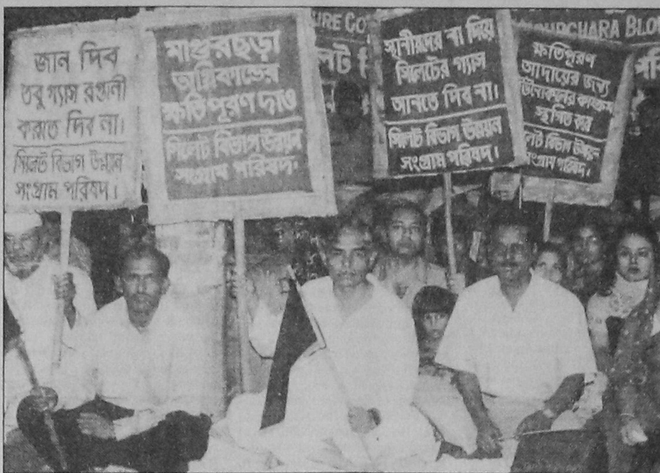
The Sylhet Division Development Action Council staged a demonstration in the city yesterday demanding compensation for the victims of Magurchhara gas-field explosion.