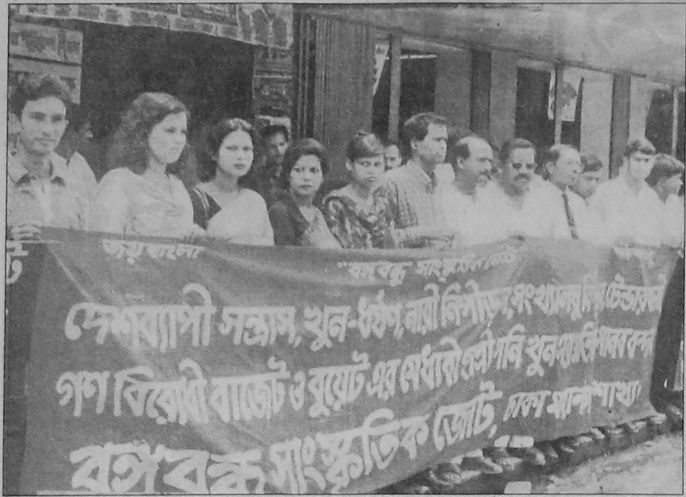
The Bangabandhu Sangskritik Jote formed a human chain at Bangabandhu Avenue in the city yesterday to protest growing violence across the country.