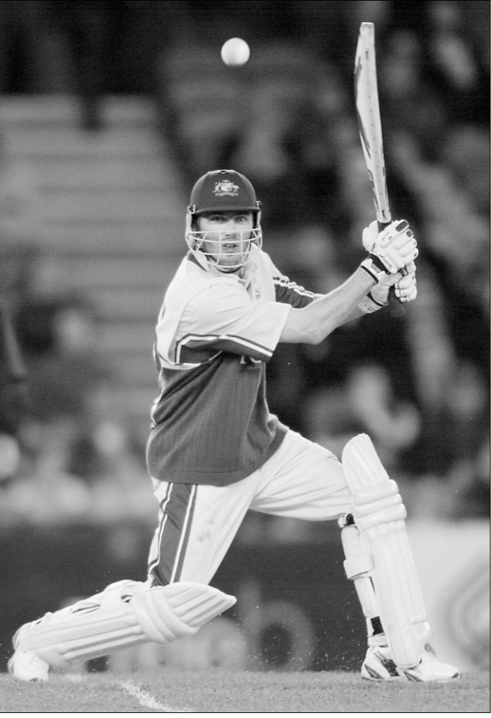
Australia's Damien Martyn square-drives one against Pakistan in the first one-day international in Melbourne yesterday.