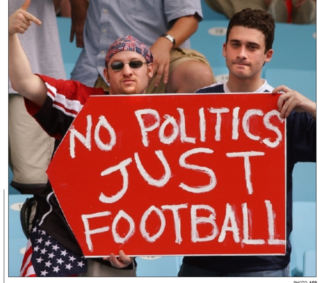
THE MESSAGE IS CLEAR: Two US fans display a 'peace and harmony' message from the stands at Daegu yesterday during the USA-South Korea match.

"To have four points is a good SEE PAGE 15 COL 6