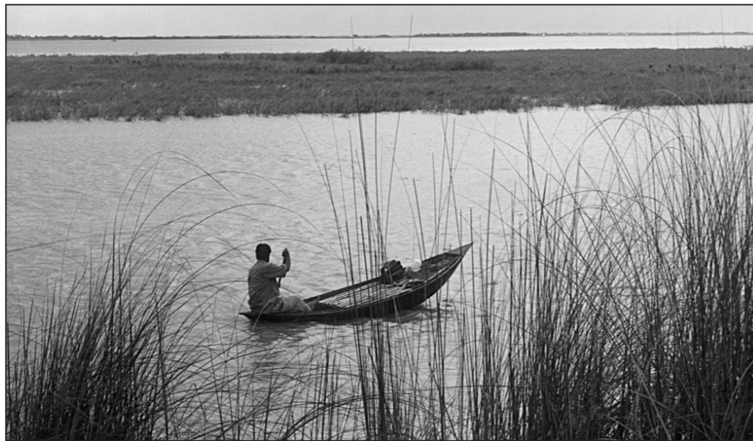
It's afternoon on the Jamuna