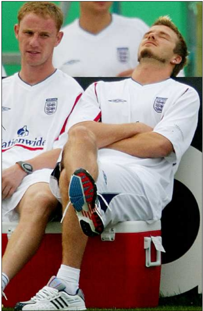
WELL EARNED NAP! England captain David Beckham rests beside teammate Nicky Butt during practice at Awaji yesterday.