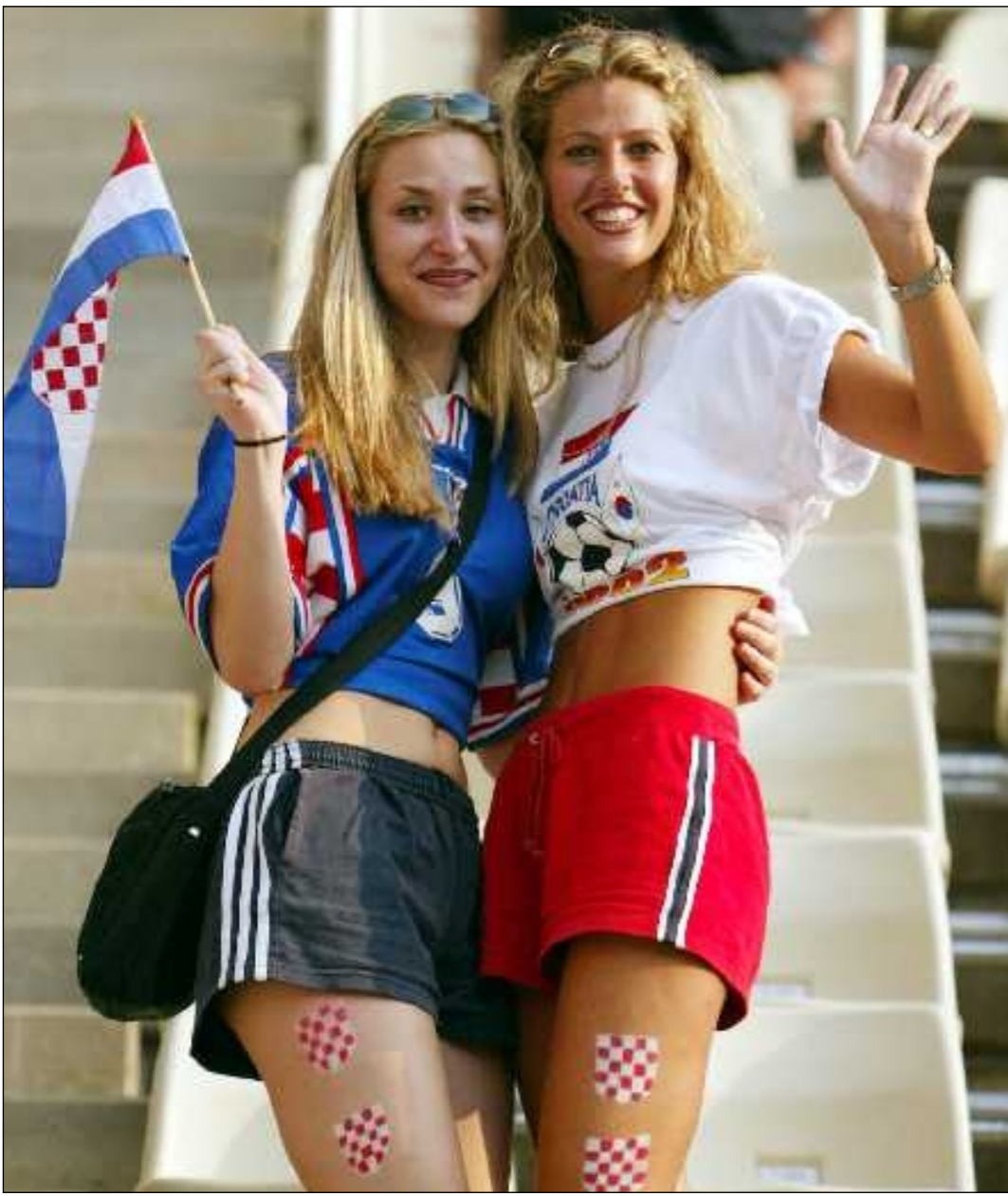
CROATIA WERE BEAUTIFUL YESTERDAY! Two Croatian girls draped in their national colours at Ibaraki during the match against Italy yesterday.