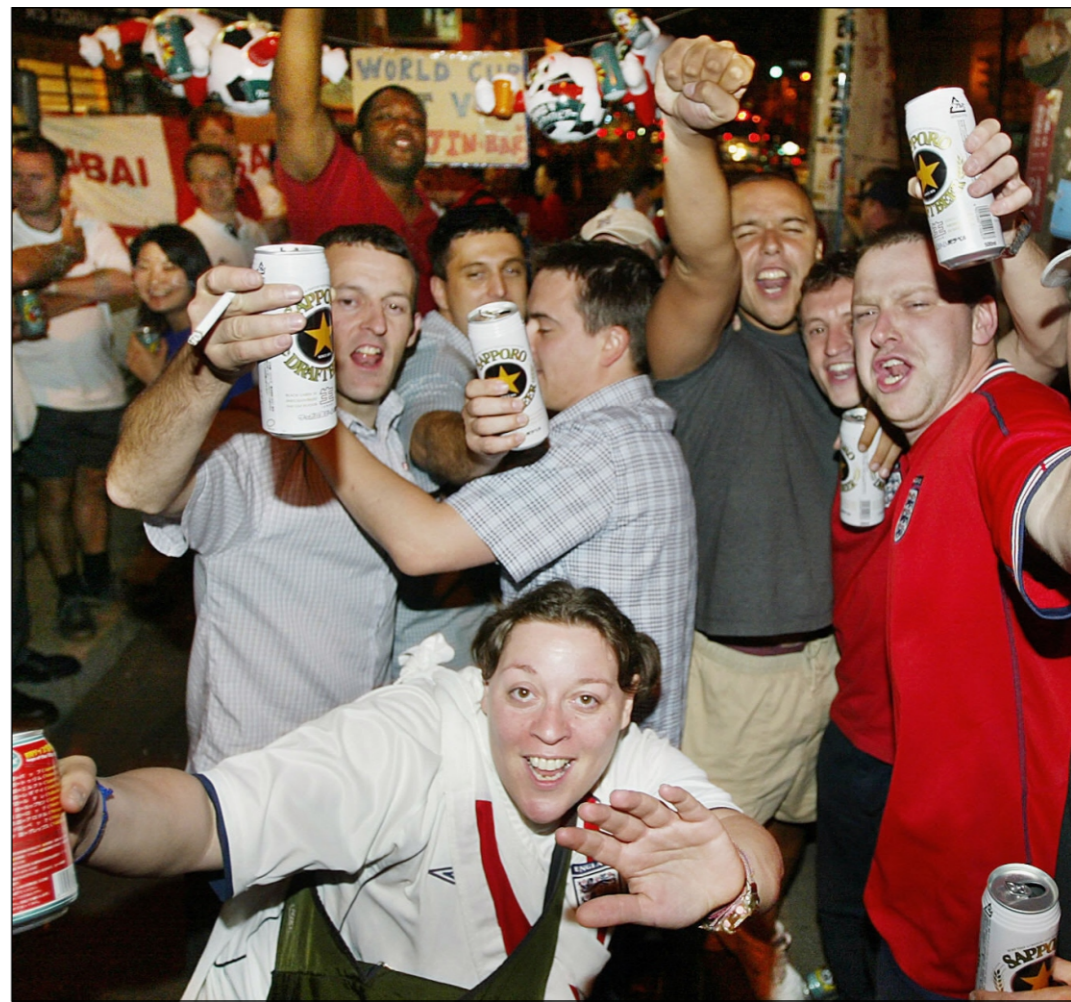
B FOR BEER, B FOR BECKHAM! Ecstatic England fans celebrate the victory over Argentina while drinking beer at Sapporo yesterday.