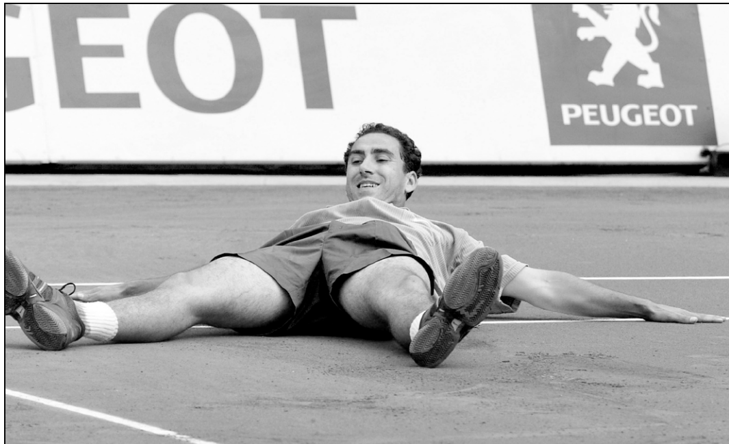
Finalist Spaniard Albert Costa lies down on the court after beating compatriot Alex Corretja in the semifinal of French Open on June 7.

Australia will host a three-match one-day series against Pakistan starting on Wednesday in Melbourne.