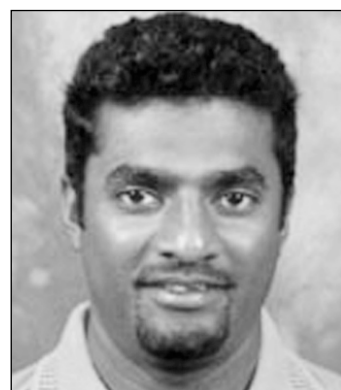
MUTTIAH MURALITHARAN has taken more than 400 test wickets, was no-balled for throwing during previous tours of Australia. The Sri Lankan was reported in

Australian newspapers to be anxious to avoid another controversial visit to the country on the eve of the 2003 World Cup in South Africa.