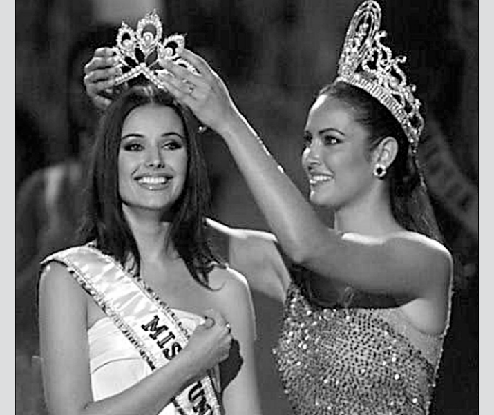
Is beauty anti women?