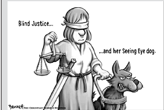
Good justice, bad justice and no justice

Our Honourable Law, Justice and Parliamentary Affairs Minister Barrister Moudud Ahmed delivered a speech on "Importance of Judicial Reforms in Bangladesh" as the chief guest at luncheon meeting on AmCham, "people want fair justice as quickly as possible but the present legal system is the archaic one and good justice is defeated". Hats off to our polymath Law Minister to pontificate the legal reality from the angle of naivety.